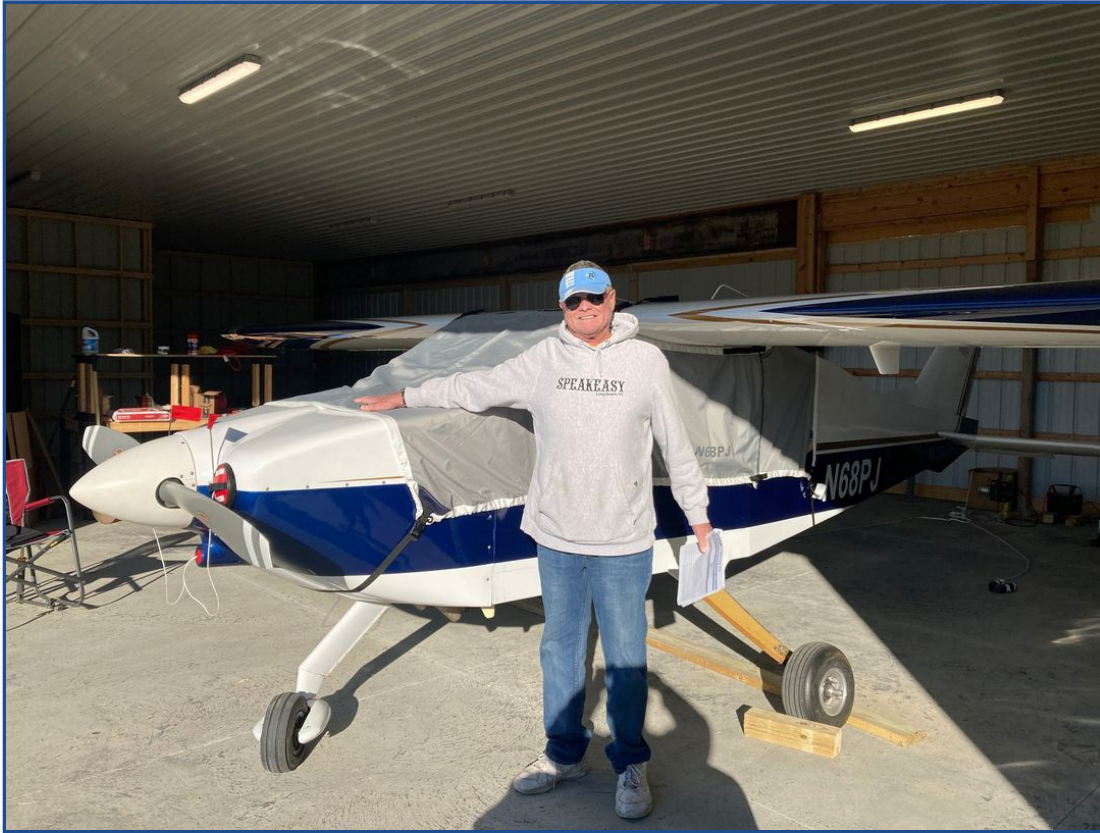
Bede BD-4 Travel Cover, Light Weight Canopy Cover, Wrap-Around