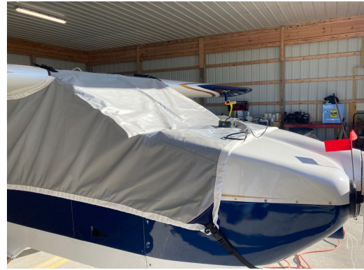
Bede BD-4 Travel Cover, Light Weight Canopy Cover, Wrap-Around