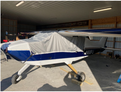
Bede BD-4 Travel Cover, Light Weight Canopy Cover, Wrap-Around