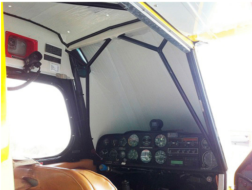
Bellanca Citabria Windshield & Skylight HeatShields

foam with a silver mylar finish. The semi-rigid design is stiff enough to stand along the inside of the windshield using sun visors or window framing. It folds up flat and easily stores in the included storage sleeve. Some designs may require velcro and suction cups or split right and left sides. A Heatshield is an excellent short-term remedy for cockpit overheating. An external fabric cover is far more effective and practical for long-term protection.