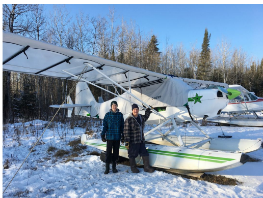
Bellanca Citabria Canopy Cover (extends to tail), Wing Covers, Empennage Covers