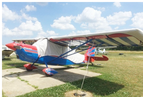
Bellanca Decathlon Canopy Cover (Over-Top, Extended to tail), Wing Covers, Engine Plugs