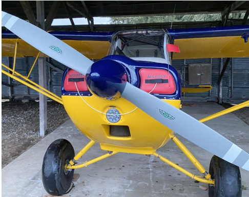
American Champion Citabria canopy cover over the top style, extends to cover gas caps, Engine Plugs American Champion Engine Inlet Plugs