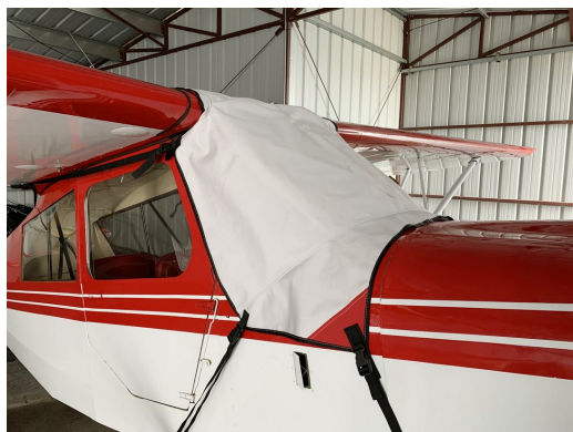
Bellanca Citabria Windshield/Skylight Cover

This cover type is made from Silver Acrylic Sunbrella canvas and is 100% lined with a soft and smooth microfiber. Bruce's Custom Covers developed this material combination especially for aircraft protection. The outer material is medium weight and treated for water resistance, UV resistance and anti-static buildup. The inner lining is a very soft and smooth microfiber to prevent scratching. The material is very reflective, and tests show that the cabin interior temperature can be reduced to near-ambient temperature on the hottest of days. It is water, ice and snow repellent, yet breathable to allow moisture to escape from between the cover and the aircraft surface.