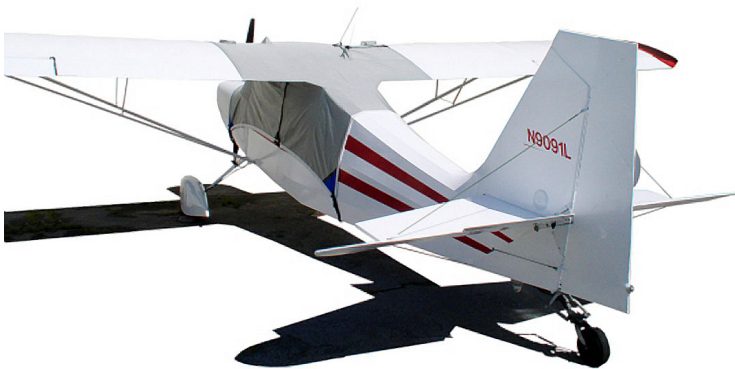
Over-Top Canopy, extended to cover gas caps

This cover type is made from Silver Acrylic Sunbrella canvas and is 100% lined with a soft and smooth microfiber. Bruce's Custom Covers developed this material combination especially for aircraft protection. The outer material is medium weight and treated for water resistance, UV resistance and anti-static buildup. The inner lining is a very soft and smooth microfiber to prevent scratching. The material is very reflective, and tests show that the cabin interior temperature can be reduced to near-ambient temperature on the hottest of days. It is water, ice and snow repellent, yet breathable to allow moisture to escape from between the cover and the aircraft surface.