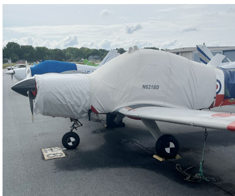
Scottish Aviation Bulldog Canopy & Engine Covers

This cover type is made from Silver Acrylic Sunbrella canvas and is 100% lined with a soft and smooth microfiber. Bruce's Custom Covers developed this material combination especially for aircraft protection. The outer material is medium weight and treated for water resistance, UV resistance and anti-static buildup. The inner lining is a very soft and smooth microfiber to prevent scratching. The material is very reflective, and tests show that the cabin interior temperature can be reduced to near-ambient temperature on the hottest of days. It is water, ice and snow repellent, yet breathable to allow moisture to escape from between the cover and the aircraft surface.