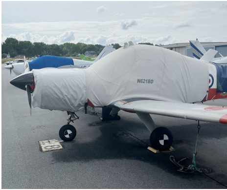
Scottish Aviation Bulldog Canopy & Engine Covers

This cover type is made from Silver Acrylic Sunbrella canvas and is 100% lined with a soft and smooth microfiber. Bruce's Custom Covers developed this material combination especially for aircraft protection. The outer material is medium weight and treated for water resistance, UV resistance and anti-static buildup. The inner lining is a very soft and smooth microfiber to prevent scratching. The material is very reflective, and tests show that the cabin interior temperature can be reduced to near-ambient temperature on the hottest of days. It is water, ice and snow repellent, yet breathable to allow moisture to escape from between the cover and the aircraft surface.