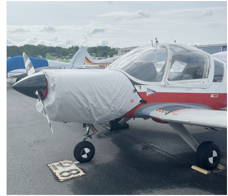
Scottish Aviation Bulldog Engine Cover