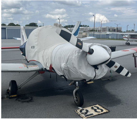
Scottish Aviation Bulldog Canopy & Engine Covers

This cover type is made from Silver Acrylic Sunbrella canvas and is 100% lined with a soft and smooth microfiber. Bruce's Custom Covers developed this material combination especially for aircraft protection. The outer material is medium weight and treated for water resistance, UV resistance and anti-static buildup. The inner lining is a very soft and smooth microfiber to prevent scratching. The material is very reflective, and tests show that the cabin interior temperature can be reduced to near-ambient temperature on the hottest of days. It is water, ice and snow repellent, yet breathable to allow moisture to escape from between the cover and the aircraft surface.