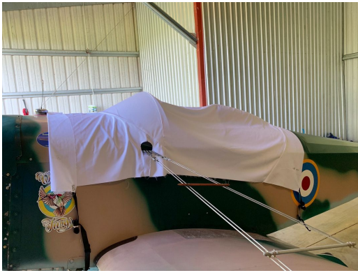
Bowers Flybaby Canopy Cover, test fit design