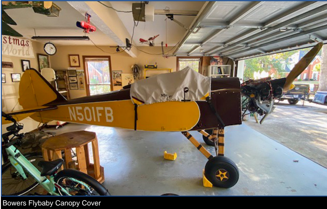
Bowers Flybaby Canopy Cover