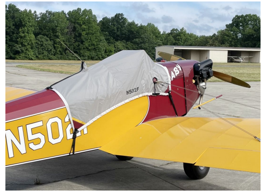
Bowers Fly Baby Canopy Cover