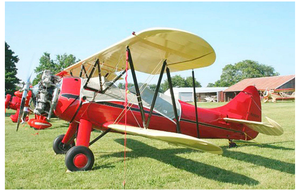
Waco YMF Canopy Cover