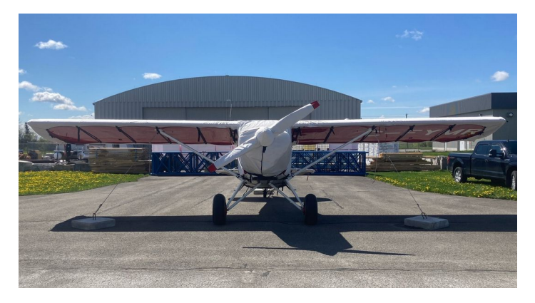
Bearhawk 4-Place Complete Cover Set

Aviat Husky Engine Plugs, Canopy, Wing & Empennage Covers