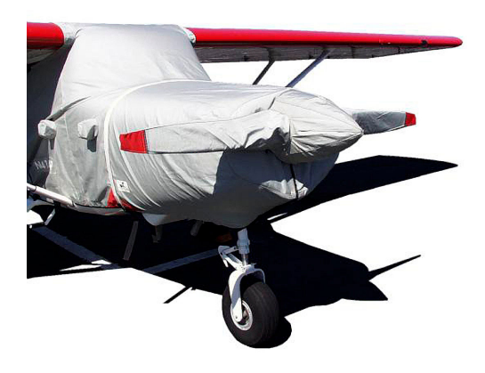
Maule M-7 Prop, Engine, Extended Canopy Covers