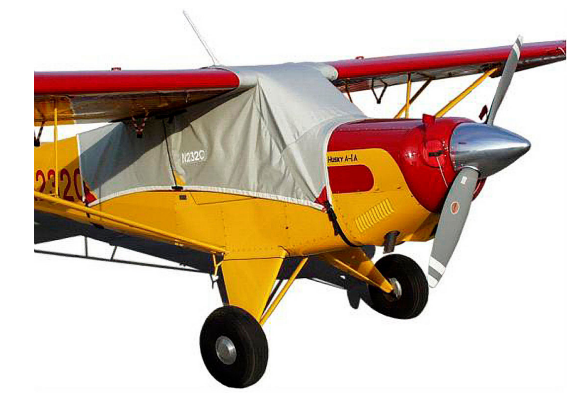
Aviat Husky Canopy Cover & Engine Plugs

Engine Inlet Plugs are custom fit for your Bearhawk Patrol Model (2 Place) intakes, made with heavy-duty vinyl material, and stuffed with a single block of sculpted urethane foam. Each plug has a zipper that allows the foam to be removed and dried if necessary. Engine plugs have warning flags that are visible from the cockpit or 'remove before flight' streamers sewn onto the face of the plugs. Most plugs are imprinted with the aircraft registration number in black for an extra charge. Storage bag NOT included. Engine plugs may be inserted after flight when the engine is still warm. Engine Inlet Plugs are commonly referred to as Cowl Plugs, Intake Plugs, Cowl Blocks, Engine Blocks, and Engine Bungs.