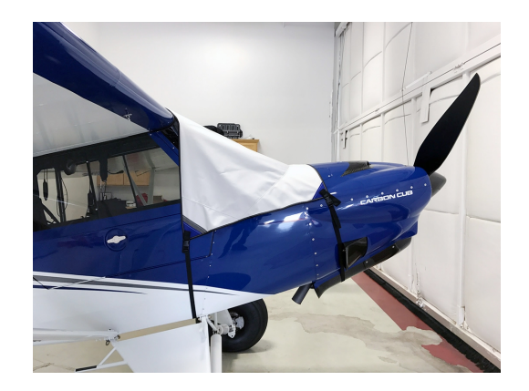
Cub Crafters Carbon Cub FX3 Windshield/Skylight Cover, travel weight