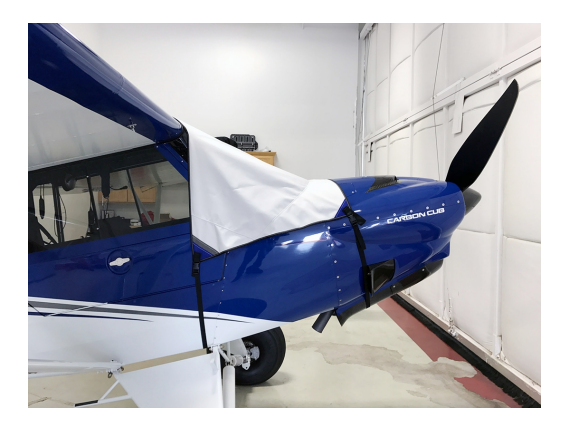
Piper PA-12 Super Cruiser Extended Over-the-Tope Canopy Cover & Engine Cover