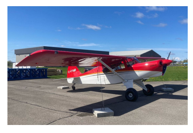
Bearhawk 4-Place Complete Cover Set, BEFORE

This cover type is made from Silver Acrylic Sunbrella canvas and is 100% lined with a soft and smooth microfiber. Bruce's Custom Covers developed this material combination especially for aircraft protection. The outer material is medium weight and treated for water resistance, UV resistance and anti-static buildup. The inner lining is a very soft and smooth microfiber to prevent scratching. The material is very reflective, and tests show that the cabin interior temperature can be reduced to near-ambient temperature on the hottest of days. It is water, ice and snow repellent, yet breathable to allow moisture to escape from between the cover and the aircraft surface.