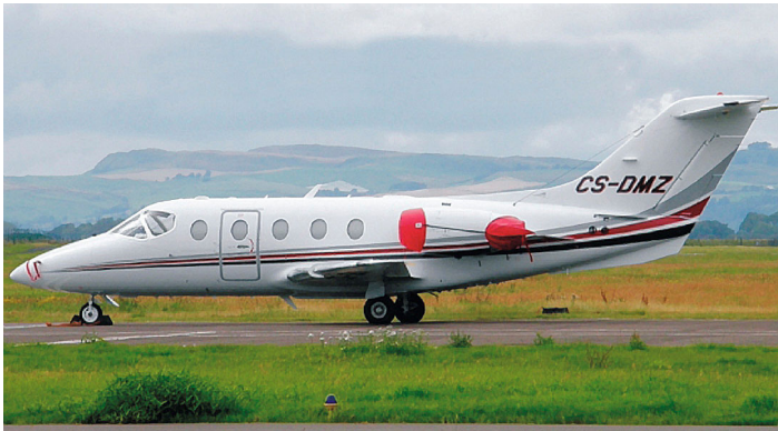
Beechjet 400 Engine & Pitot Covers

The Hawker Beechcraft Beechjet 400, Hawker 400XP (T1A, T400 Jayhawk) Intake Covers are designed to install easily yet be completely storable. A spring steel hoop is sewn into the hem of each cover, allowing them to be installed without climbing onto the wing or using a stepladder. To store the covers the spring steel hoop folds like a band-saw blade into three nesting rings. Each cover folds into a compact circular bundle which is stored in the included duffel bag, yet they unfold quickly for use. The Tri-Fold Ring cover is made of medium weight nylon which is available in a variety of colors to match the paint trim. Each cover set comes complete with installation and folding instructions. The aircraft's registration number can be silkscreened onto the cover for an extra charge.