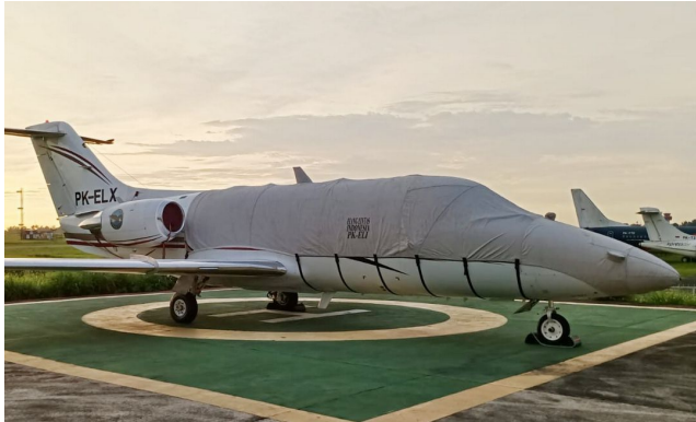
Beechjet Fuselage/Nose Cover

This cover type is made from Silver Acrylic Sunbrella canvas and is 100% lined with a soft and smooth microfiber. Bruce's Custom Covers developed this material combination especially for aircraft protection. The outer material is medium weight and treated for water resistance, UV resistance and anti-static buildup. The inner lining is a very soft and smooth microfiber to prevent scratching. The material is very reflective, and tests show that the cabin interior temperature can be reduced to near-ambient temperature on the hottest of days. It is water, ice and snow repellent, yet breathable to allow moisture to escape from between the cover and the aircraft surface.