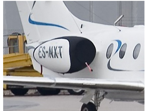
Nextant 400XTi Bikini Type Engine Covers