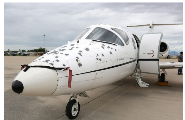
Raytheon Beechjet Hail Damage, and Pitot Covers