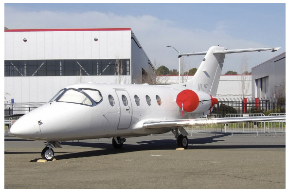
Beechjet Engine Covers, Cockpit HeatShields