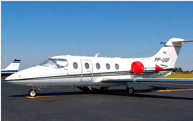
Beechjet 400 Engine Covers & Cockpit HeatShields

The Hawker Beechcraft Beechjet 400, Hawker 400XP (T1A, T400 Jayhawk) Intake Covers are designed to install easily yet be completely storable. A spring steel hoop is sewn into the hem of each cover, allowing them to be installed without climbing onto the wing or using a stepladder. To store the covers the spring steel hoop folds like a band-saw blade into three nesting rings. Each cover folds into a compact circular bundle which is stored in the included duffel bag, yet they unfold quickly for use. The Tri-Fold Ring cover is made of medium weight nylon which is available in a variety of colors to match the paint trim. Each cover set comes complete with installation and folding instructions. The aircraft's registration number can be silkscreened onto the cover for an extra charge.