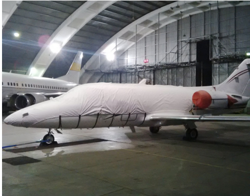
Beechjet 400 Cabin/Nose Cover, Engine Covers

This cover type is made from Silver Acrylic Sunbrella canvas and is 100% lined with a soft and smooth microfiber. Bruce's Custom Covers developed this material combination especially for aircraft protection. The outer material is medium weight and treated for water resistance, UV resistance and anti-static buildup. The inner lining is a very soft and smooth microfiber to prevent scratching. The material is very reflective, and tests show that the cabin interior temperature can be reduced to near-ambient temperature on the hottest of days. It is water, ice and snow repellent, yet breathable to allow moisture to escape from between the cover and the aircraft surface.