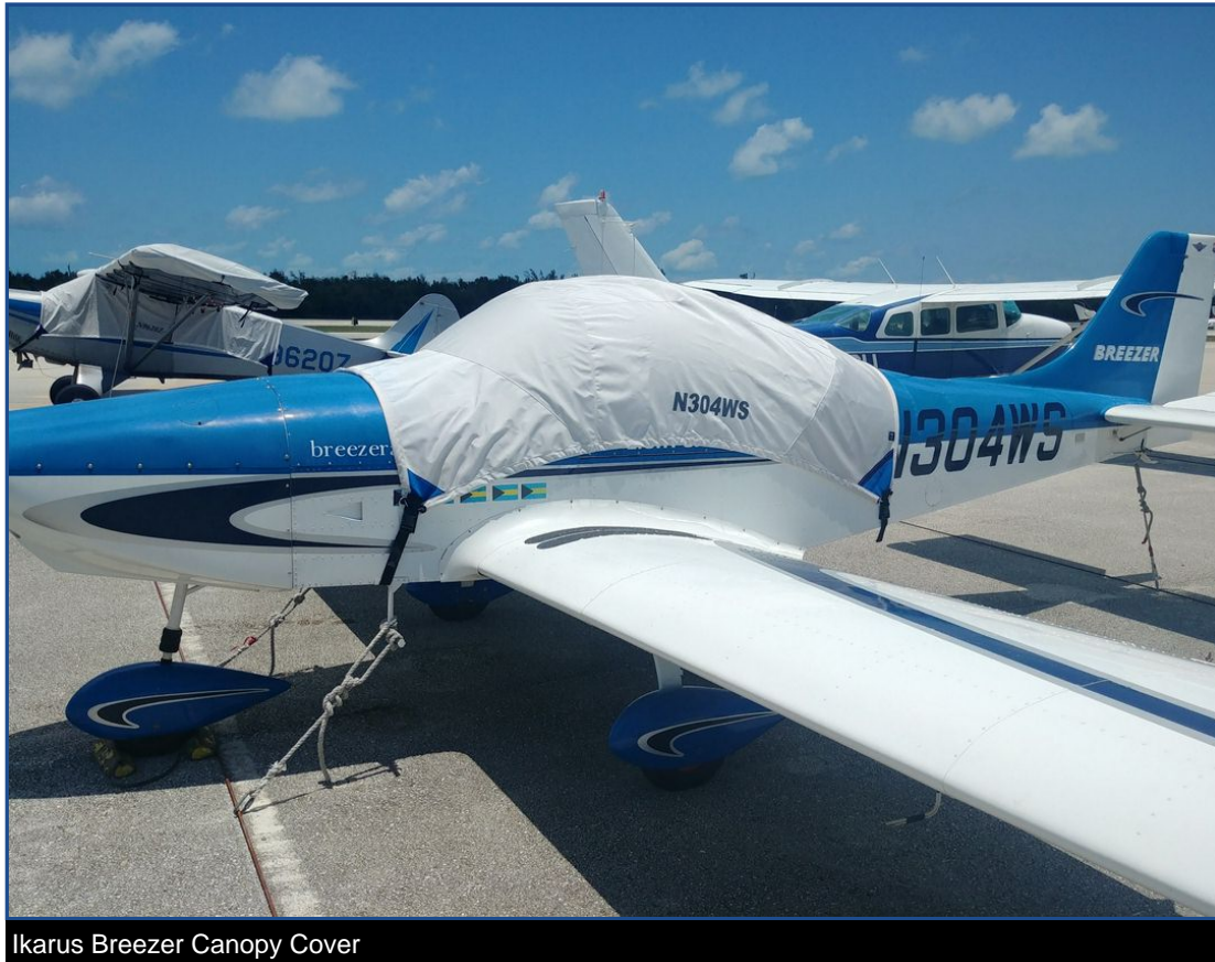
Ikarus Breezer Canopy Cover