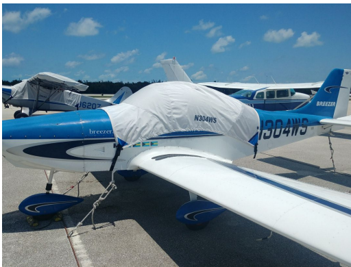
Ikarus Breezer Canopy Cover

This cover type is made from Silver Acrylic Sunbrella canvas and is 100% lined with a soft and smooth microfiber. Bruce's Custom Covers developed this material combination especially for aircraft protection. The outer material is medium weight and treated for water resistance, UV resistance and anti-static buildup. The inner lining is a very soft and smooth microfiber to prevent scratching. The material is very reflective, and tests show that the cabin interior temperature can be reduced to near-ambient temperature on the hottest of days. It is water, ice and snow repellent, yet breathable to allow moisture to escape from between the cover and the aircraft surface.