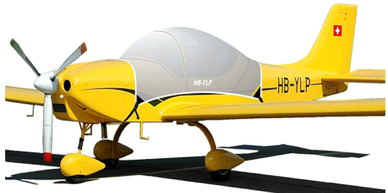
Ikarus Breezer Canopy Cover (illustration)