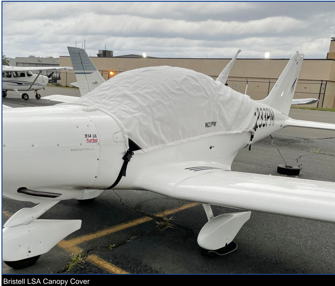
Bristell LSA Canopy Cover