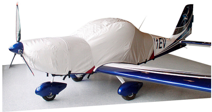
Evekotor Sportstar Extended Canopy/Engine Cover