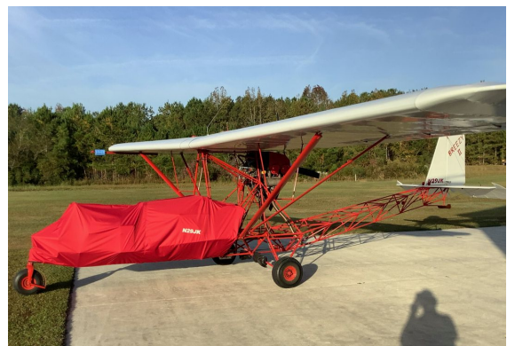
Breezy Forward Fuselage Enclosure