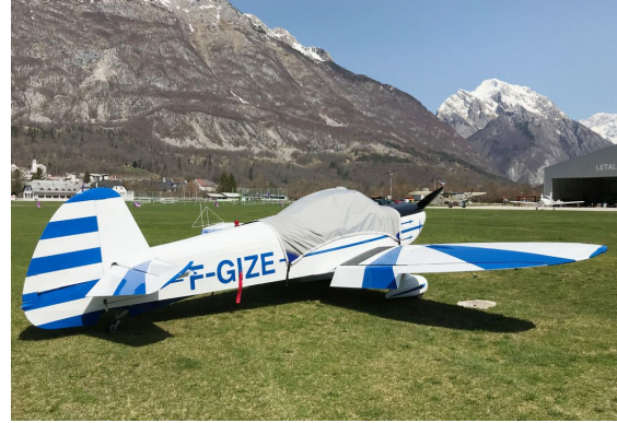
Mudry Cap 10 Canopy Cover