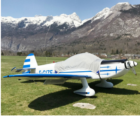
Mudry Cap 10 Canopy Cover

water resistance, UV resistance and anti-static buildup. The inner lining is a very soft and smooth microfiber to prevent scratching. The material is very reflective, and tests show that the cabin interior temperature can be reduced to near-ambient temperature on the hottest of days. It is water, ice and snow repellent, yet breathable to allow moisture to escape from between the cover and the aircraft surface.