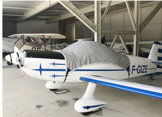
Mudry Cap 10 Travel Cover, Light Weight Travel Canopy Cover