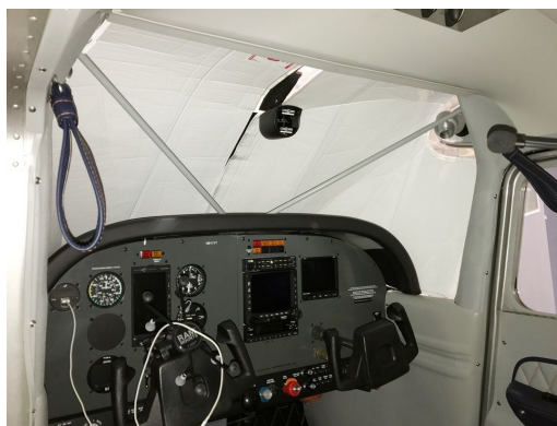
Cessna 180 Skywagon Windshield Heatshield, (W/ Compass)