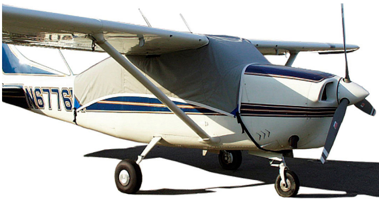
Canopy covers are available in belly strap, snap-on or Over-the-Top Styles