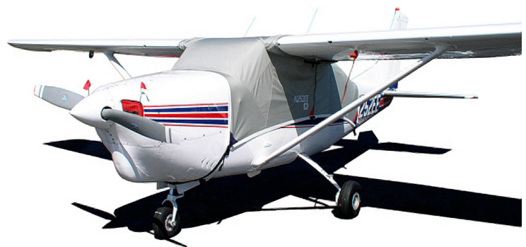
Cessna 210 Over-Top Canopy Cover