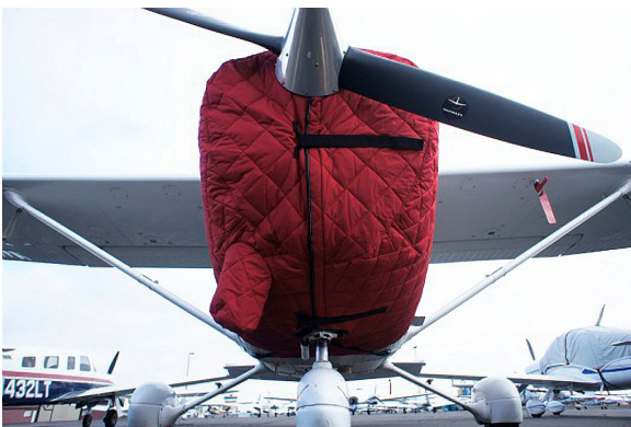
Cessna 172 Insulated Engine Cover, fully enclosed around bottom

This cover type is made from Silver Acrylic Sunbrella canvas and is 100% lined with a soft and smooth microfiber. Bruce's Custom Covers developed this material combination especially for aircraft protection. The outer material is medium weight and treated for water resistance, UV resistance and anti-static buildup. The inner lining is a very soft and smooth microfiber to prevent scratching. The material is very reflective, and tests show that the cabin interior temperature can be reduced to near-ambient temperature on the hottest of days. It is water, ice and snow repellent, yet breathable to allow moisture to escape from between the cover and the aircraft surface.