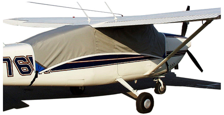
Cessna 206 Standard Canopy Cover