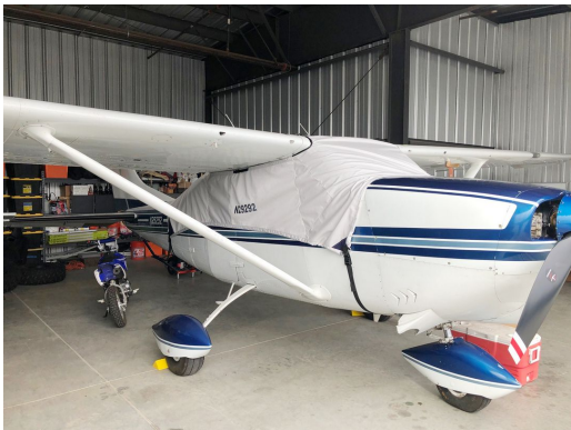
Cessna 206 Wrap-Around Canopy Cover

This cover type is made from Silver Acrylic Sunbrella canvas and is 100% lined with a soft and smooth microfiber. Bruce's Custom Covers developed this material combination especially for aircraft protection. The outer material is medium weight and treated for water resistance, UV resistance and anti-static buildup. The inner lining is a very soft and smooth microfiber to prevent scratching. The material is very reflective, and tests show that the cabin interior temperature can be reduced to near-ambient temperature on the hottest of days. It is water, ice and snow repellent, yet breathable to allow moisture to escape from between the cover and the aircraft surface.