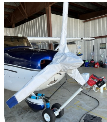
Cessna 182 Skylane 3-Blade Prop Cover