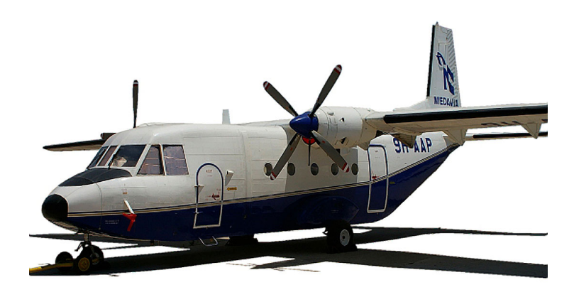
Casa 212 Engine Plugs