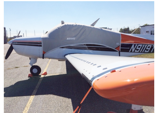
Beech Musketeer Canopy Cover