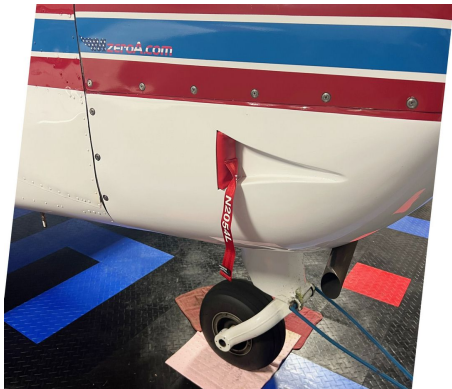
Beech Sundowner C23 Fresh Air Exhaust Plug (Pilot Side Of Fuselage)

plugs have warning flags that are visible from the cockpit or 'remove before flight' streamers sewn onto the face of the plugs. Most plugs are imprinted with the aircraft registration number in black for an extra charge. Storage bag NOT included. Engine plugs may be inserted after flight when the engine is still warm. Engine Inlet Plugs are commonly referred to as Cowl Plugs, Intake Plugs, Cowl Blocks, Engine Blocks, and Engine Bungs.