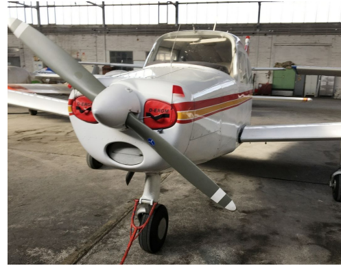
Beech Musketeer Engine Inlet Plugs