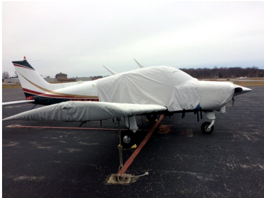
Beech Sundowner Extended Canopy Cover, Engine, and Wing Covers