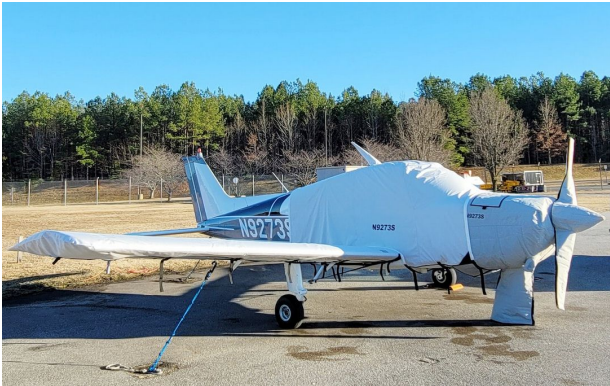
Beech Sundowner Winter Cover Set

This cover type is made from Silver Acrylic Sunbrella canvas and is 100% lined with a soft and smooth microfiber. Bruce's Custom Covers developed this material combination especially for aircraft protection. The outer material is medium weight and treated for water resistance, UV resistance and anti-static buildup. The inner lining is a very soft and smooth microfiber to prevent scratching. The material is very reflective, and tests show that the cabin interior temperature can be reduced to near-ambient temperature on the hottest of days. It is water, ice and snow repellent, yet breathable to allow moisture to escape from between the cover and the aircraft surface.