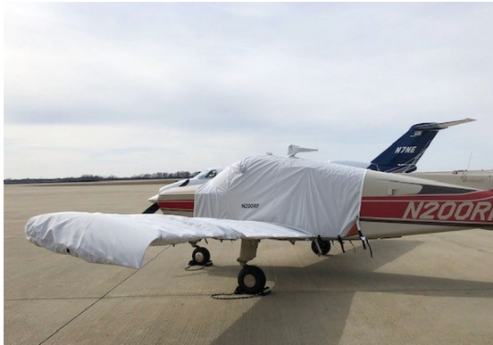
Beech C23 Extended Canopy Cover, Wing Covers