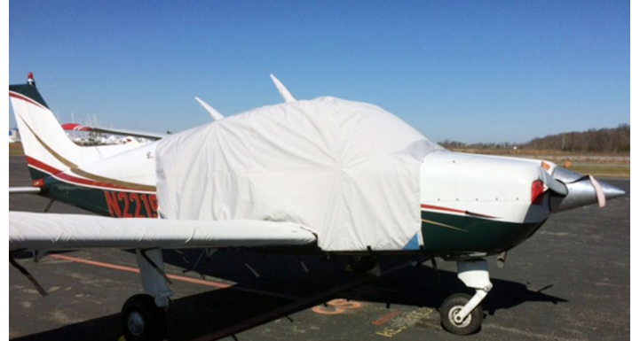
Beech Sundowner Extended Canopy Cover, Belly Strap Type