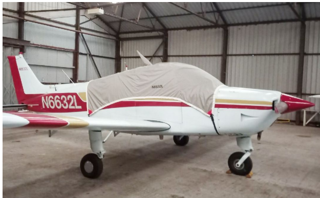
Beech Sundowner Travel Cover, Light Weight Canopy Cover

Travel Covers are made with Silver Solution-Dyed Polyester fabric and only lined over the windshield to save weight. The material is lightweight and more compact for easy stowage in the aircraft. The polyester material is water resistant, but only intended for occasional use outside. We also have an ultra lightweight material available for fitted hangar dust covers. For daily outdoor use, the non-travel Sunbrella Cover is the best choice.