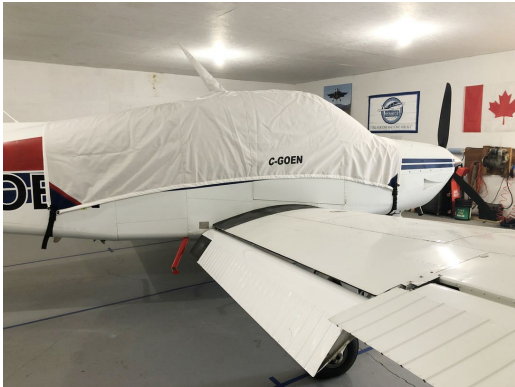
Beech Sierra B24R Canopy Cover

This cover type is made from Silver Acrylic Sunbrella canvas and is 100% lined with a soft and smooth microfiber. Bruce's Custom Covers developed this material combination especially for aircraft protection. The outer material is medium weight and treated for water resistance, UV resistance and anti-static buildup. The inner lining is a very soft and smooth microfiber to prevent scratching. The material is very reflective, and tests show that the cabin interior temperature can be reduced to near-ambient temperature on the hottest of days. It is water, ice and snow repellent, yet breathable to allow moisture to escape from between the cover and the aircraft surface.