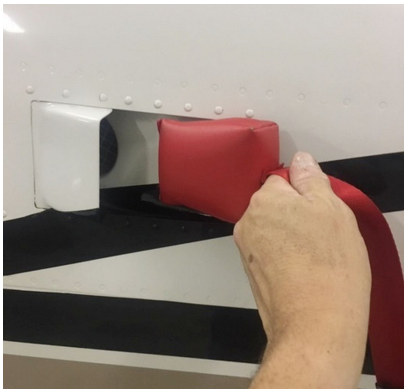
BEECH V35B Fresh Air Exhaust Plug