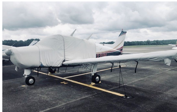
Beech Sundowner Extended Canopy Cover, Fully Enclosed Engine Cover, Wing Covers