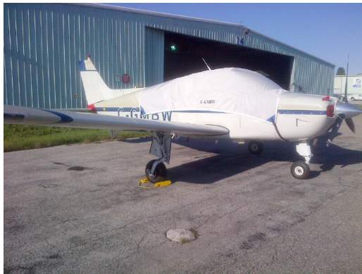
Beech Sierra Canopy Cover, Engine Plugs, Tailcone Cover

Travel Covers are made with Silver Solution-Dyed Polyester fabric and only lined over the windshield to save weight. The material is lightweight and more compact for easy stowage in the aircraft. The polyester material is water resistant, but only intended for occasional use outside. We also have an ultra lightweight material available for fitted hangar dust covers. For daily outdoor use, the non-travel Sunbrella Cover is the best choice.