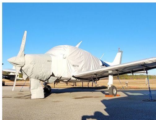
Beech Sundowner Winter Cover Set