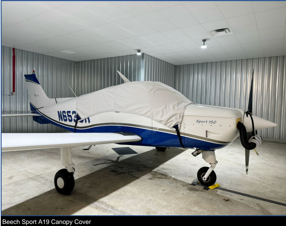
Beech Sport A19 Canopy Cover