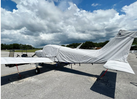
Beech Musketeer A23 Cover Set

This cover type is made from Silver Acrylic Sunbrella canvas and is 100% lined with a soft and smooth microfiber. Bruce's Custom Covers developed this material combination especially for aircraft protection. The outer material is medium weight and treated for water resistance, UV resistance and anti-static buildup. The inner lining is a very soft and smooth microfiber to prevent scratching. The material is very reflective, and tests show that the cabin interior temperature can be reduced to near-ambient temperature on the hottest of days. It is water, ice and snow repellent, yet breathable to allow moisture to escape from between the cover and the aircraft surface.