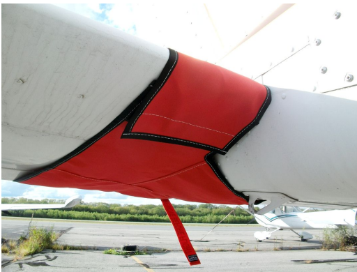
Beech Musketeer Tailcone Cover (Fully Enclosed)

WINTER USE MATERIAL - Made with Solution-Dyed Polyester fabric, this option is intended for seasonal use to aid in deicing, rain mitigation, or for occasional travel. The material is lighter and more compact, but more susceptible to UV damage and may have a shorter useful life if used continuously outside than the all-year use material.