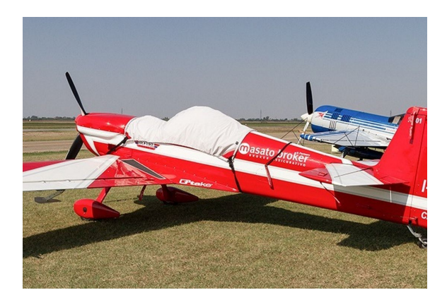
Mudry Cap 231 Canopy Cover

The Mudry Cap 231 & 232 Canopy/Engine Cover is a one-piece cover (100% lined with microfiber) that is a combination of the Canopy Cover and Engine Cover. This cover will enclose the engine cowl and will extend aft to cover all of the windows. This cover type is made from Silver Acrylic Sunbrella canvas and is 100% lined with a soft and smooth microfiber. Bruce's Custom Covers developed this material combination especially for aircraft protection. The outer material is medium weight and treated for water resistance, UV resistance and anti-static buildup. The inner lining is a very soft and smooth microfiber to prevent scratching. The material is very reflective, and tests show that the cabin interior temperature can be reduced to near-ambient temperature on the hottest of days. It is water, ice and snow repellent, yet breathable to allow moisture to escape from between the cover and the aircraft surface.