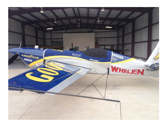
Extra 300SC with NASCAR style custom cover