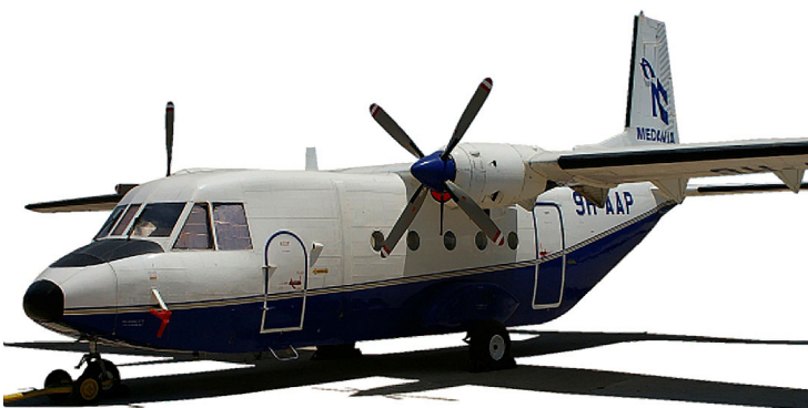
Casa 212 Engine Plugs

Engine Inlet Plugs are custom fit for your Casa/IPTN CN-235 intakes, made with heavy-duty vinyl material, and stuffed with a single block of sculpted urethane foam. Each plug has a zipper that allows the foam to be removed and dried if necessary. Engine plugs have warning flags that are visible from the cockpit or 'remove before flight' streamers sewn onto the face of the plugs. Most plugs are imprinted with the aircraft registration number in black for an extra charge. Storage bag NOT included. Engine plugs may be inserted after flight when the engine is still warm. Engine Inlet Plugs are commonly referred to as Cowl Plugs, Intake Plugs, Cowl Blocks, Engine Blocks, and Engine Bungs.