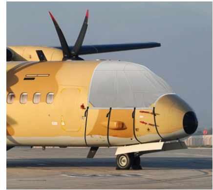
Casa C-295 Cockpit Cover (illustration)