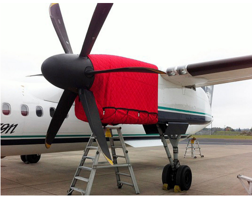
Dash 8-Q400 Insulated Engine Cover