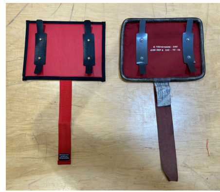
Canadair Challenger 300, 350 APU Intake Cover