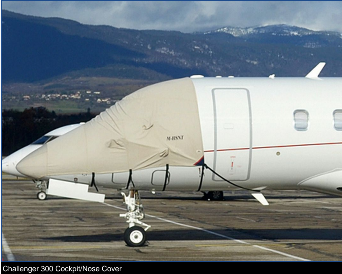
Challenger 300 Cockpit/Nose Cover