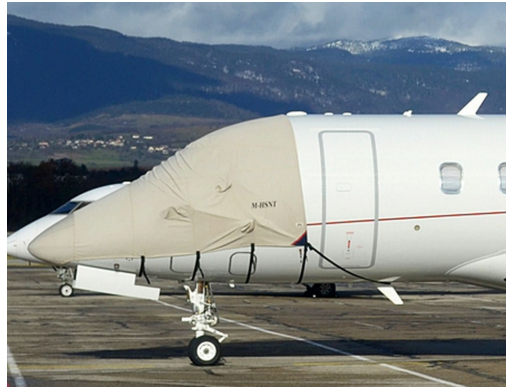
Challenger 300 Cockpit/Nose Cover

This cover type is made from Silver Acrylic Sunbrella canvas and is 100% lined with a soft and smooth microfiber. Bruce's Custom Covers developed this material combination especially for aircraft protection. The outer material is medium weight and treated for water resistance, UV resistance and anti-static buildup. The inner lining is a very soft and smooth microfiber to prevent scratching. The material is very reflective, and tests show that the cabin interior temperature can be reduced to near-ambient temperature on the hottest of days. It is water, ice and snow repellent, yet breathable to allow moisture to escape from between the cover and the aircraft surface.