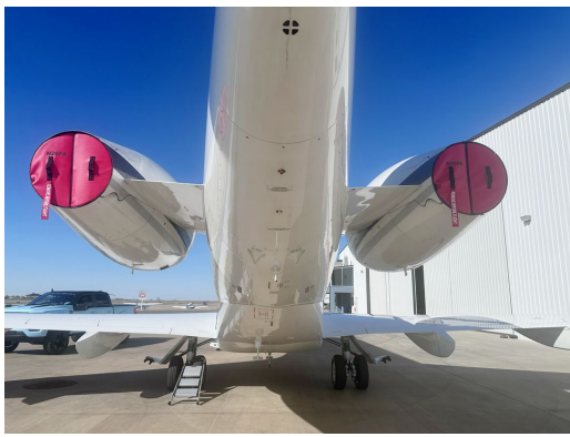
Canadair Challenger 300 Exhaust Plugs