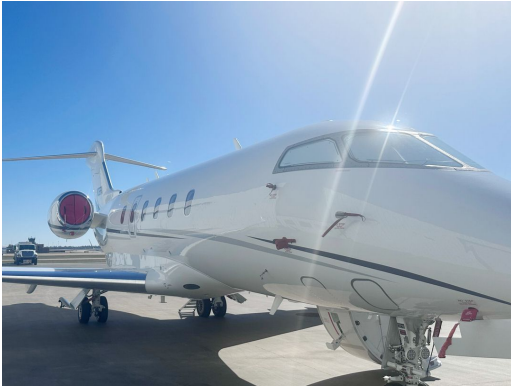
Canadair Challenger 300 Cockpit HeatShields, Intake Plugs