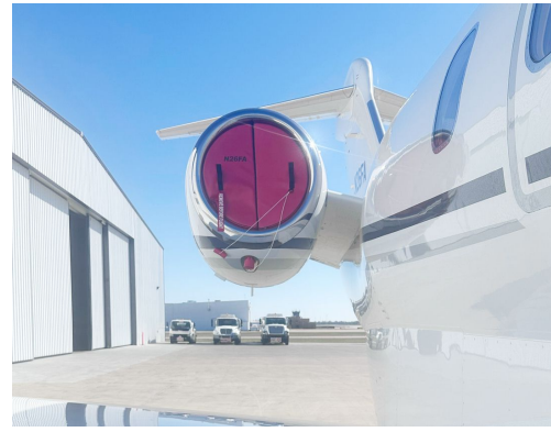
Canadair Challenger 300 Intake Plugs