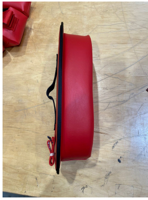
Canadair Challenger 300, 350 APU Exhaust Plug