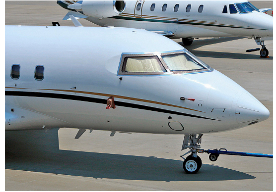
Challenger 604 Cockpit HeatShields