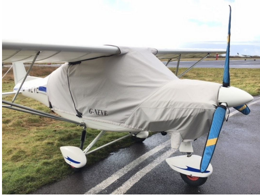
Ikarus C-42 Extended Canopy/Engine Cover