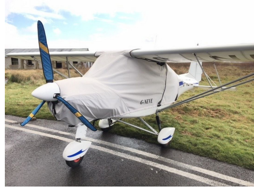
Ikarus C-42 Extended Canopy/Engine Cover