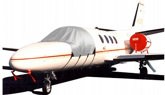
Cessna Citation Windshield Cover, Engine Cover set and Pitot Covers