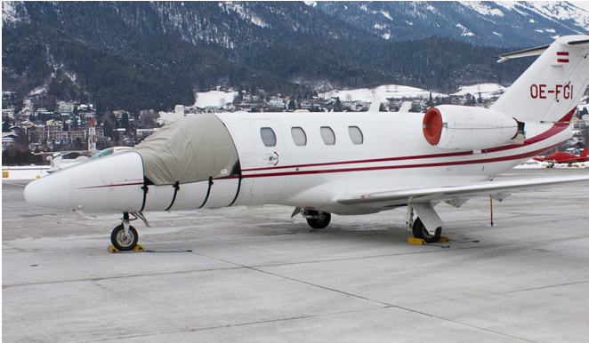
Cessna Citationjet CJ1 Cockpit Cover

Travel Covers are made with Silver Solution-Dyed Polyester fabric and only lined over the windshield to save weight. The material is lightweight and more compact for easy stowage in the aircraft. The polyester material is water resistant, but only intended for occasional use outside. We also have an ultra lightweight material available for fitted hangar dust covers. For daily outdoor use, the non-travel Sunbrella Cover is the best choice.