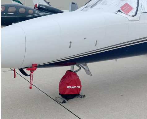
Cessna Citation Nose Tire Cover

ALL-YEAR USE MATERIAL - Made with Silver Acrylic Sunbrella canvas, the all-year use material is the best option for sun protection and cover longevity. This heavier more durable material is intended for all weather conditions, such as rain and snow or lots of sun.