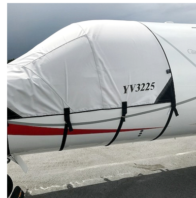
Cessna Citationjet V Ultra (560) Cockpit Cover