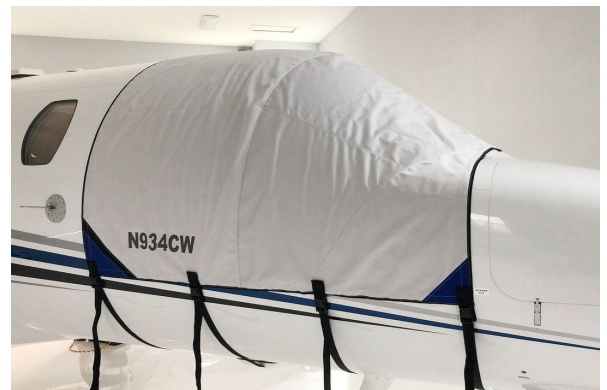
Cessna Citation M2 Cockpit Cover