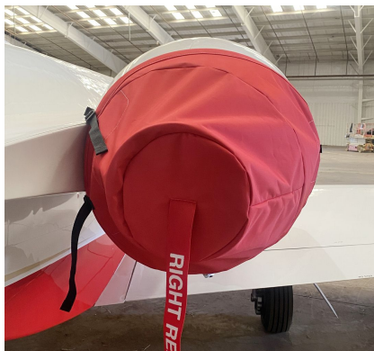
Cessna 501 Engine Covers NO TR's

The Cessna Citation I (500/501) Intake Covers are designed to install easily yet be completely storable. A spring steel hoop is sewn into the hem of each cover, allowing them to be installed without climbing onto the wing or using a stepladder. To store the covers the spring steel hoop folds like a band-saw blade into three nesting rings. Each cover folds into a compact circular bundle which is stored in the included duffle bag, yet they unfold quickly for use. The Tri-Fold Ring cover is made of medium weight nylon which is available in a variety of colors to match the paint trim. Each cover set comes complete with installation and folding instructions. The aircraft's registration number can be silkscreened onto the cover for an extra charge.