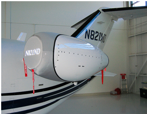
Cessna 510 Mustang Bikini Type Engine Cover

The Cessna Citation I (500/501) Intake Covers are designed to install easily yet be completely storable. A spring steel hoop is sewn into the hem of each cover, allowing them to be installed without climbing onto the wing or using a stepladder. To store the covers the spring steel hoop folds like a band-saw blade into three nesting rings. Each cover folds into a compact circular bundle which is stored in the included duffle bag, yet they unfold quickly for use. The Tri-Fold Ring cover is made of medium weight nylon which is available in a variety of colors to match the paint trim. Each cover set comes complete with installation and folding instructions. The aircraft's registration number can be silkscreened onto the cover for an extra charge.