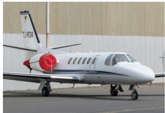
Cessna Citation II Bravo Engine Covers