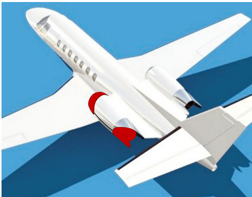
Cessna Citation II with TR's Exhaust Cover Illustration