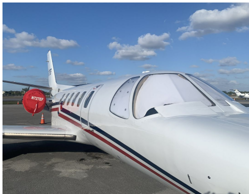
Cessna Citation S550

Custom-made Heatshield Sunshades are available for almost any window in the jet. Side windows, Skylights, and Emergency Exits are all custom-made. The product is a unique composite of closed-cell foam with a silver mylar finish. The set is easily stored in the included storage sleeve. Some designs may require velcro and suction cups. Our Heatshields are offered white side out since aircraft manufacturers have issued advisories against reflective window inserts due to potential heat damage.