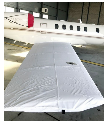
Cessna Citation CJ-4 Wing Covers, test fit cover