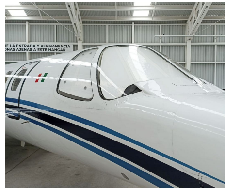
Cessna Citation I & II Cockpit HeatShields