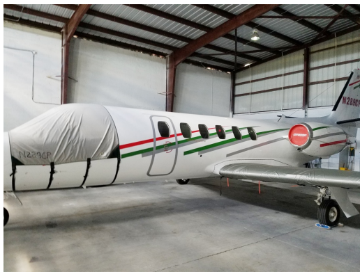
Cessna Citation II Cockpit Cover, Wing Covers