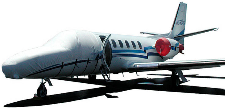
Cessna Citation Nose/Cockpit Cover, Engine Covers

This cover type is made from Silver Acrylic Sunbrella canvas and is 100% lined with a soft and smooth microfiber. Bruce's Custom Covers developed this material combination especially for aircraft protection. The outer material is medium weight and treated for water resistance, UV resistance and anti-static buildup. The inner lining is a very soft and smooth microfiber to prevent scratching. The material is very reflective, and tests show that the cabin interior temperature can be reduced to near-ambient temperature on the hottest of days. It is water, ice and snow repellent, yet breathable to allow moisture to escape from between the cover and the aircraft surface.