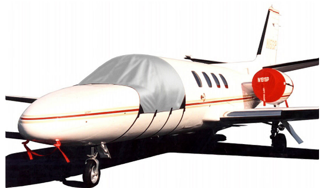
Cessna Citation Windshield Cover, Engine Cover set and Pitot Covers