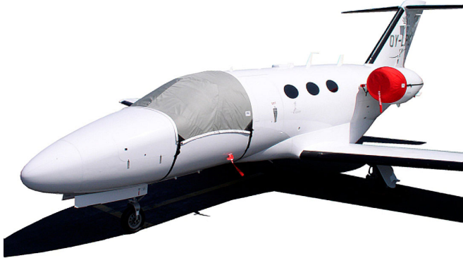
Citation Mustang Windshield Cover, Intake Cover/Exhaust Plug Set, Pitot Covers