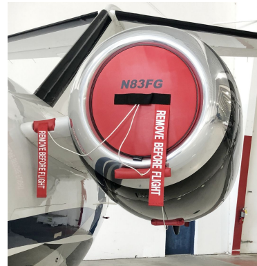
Cessna Mustang 510 Engine Inlet Plugs, Includes Intercooler Intake & Exhaust And Gen. Plugs