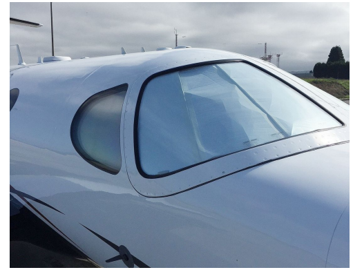
Cessna Mustang 510 Cockpit Heatshields