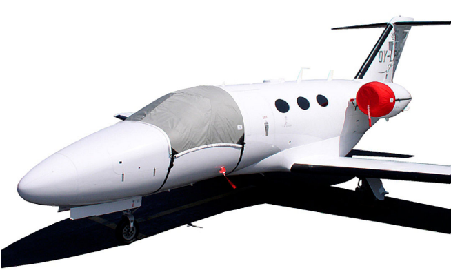
Cessna 510 Cockpit Cover extends to cover door Citation Mustang Windshield Cover, Intake Cover/Exhaust Plug Set, Pitot Covers