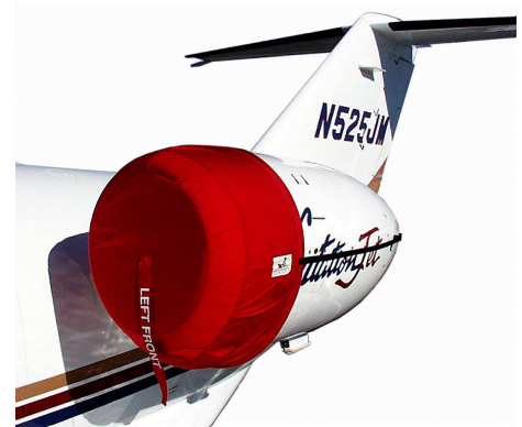
Engine Inlet Cover