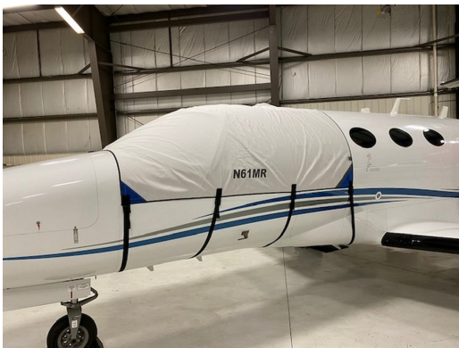
Cessna 510 Cockpit Cover extends to cover door

This cover type is made from Silver Acrylic Sunbrella canvas and is 100% lined with a soft and smooth microfiber. Bruce's Custom Covers developed this material combination especially for aircraft protection. The outer material is medium weight and treated for water resistance, UV resistance and anti-static buildup. The inner lining is a very soft and smooth microfiber to prevent scratching. The material is very reflective, and tests show that the cabin interior temperature can be reduced to near-ambient temperature on the hottest of days. It is water, ice and snow repellent, yet breathable to allow moisture to escape from between the cover and the aircraft surface.