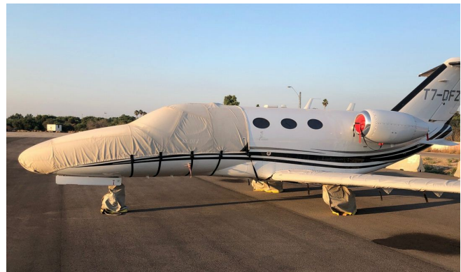
Cessna 510 Mustang Cockpit/Nose Cover, Engine Inlet Plugs