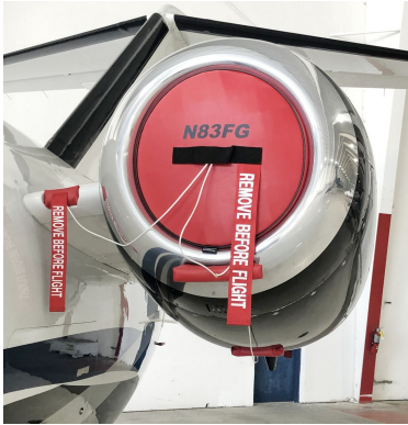
Cessna Mustang 510 Engine Inlet Plugs, Includes Intercooler Intake & Exhaust And Gen. Plugs