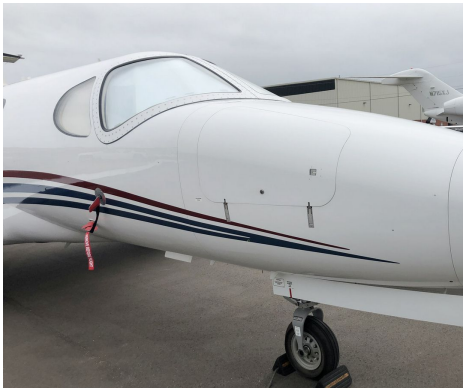
Cessna Mustang 510 Cockpit Heatshields, Pitot Cover/AOA