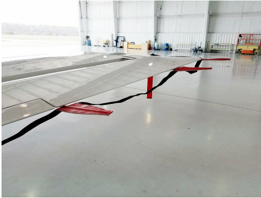
Hawker Beechcraft 800, 800XP, 850XP Static Wick Protectors

Designed to prevent damage to the aircraft extremities in crowded hangars, these products are made of bright red Naugahyde and thickly padded with a sandwich of closed cell foam.