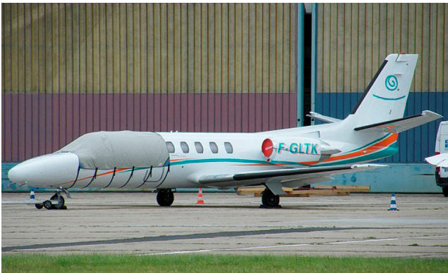
Citation Windshield Cover, to back of door