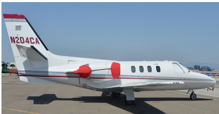
Cessna Citation Engine Covers and Heatshields

The Cessna Citation II (550, 551, UC-35A, with JT15D) Intake Covers are designed to install easily yet be completely storable. A spring steel hoop is sewn into the hem of each cover, allowing them to be installed without climbing onto the wing or using a stepladder. To store the covers the spring steel hoop folds like a band-saw blade into three nesting rings. Each cover folds into a compact circular bundle which is stored in the included duffle bag, yet they unfold quickly for use. The Tri-Fold Ring cover is made of medium weight nylon which is available in a variety of colors to match the paint trim. Each cover set comes complete with installation and folding instructions. The aircraft's registration number can be silkscreened onto the cover for an extra charge.