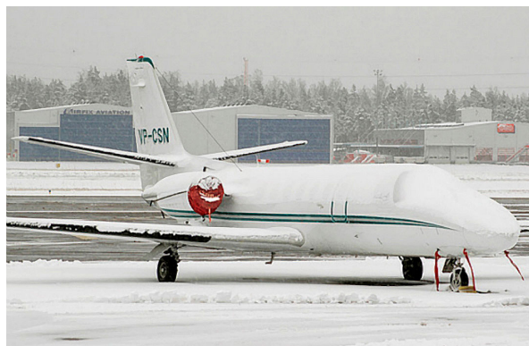
Cessna 560 Engine Inlet/Exhaust Covers, Pitot Cover Set