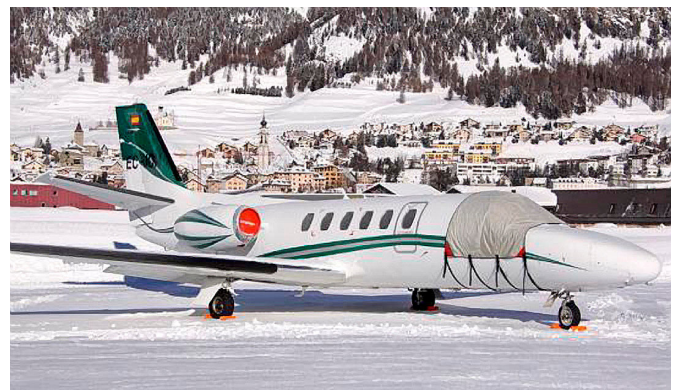
Cessna Citation 550 Windshield Cover