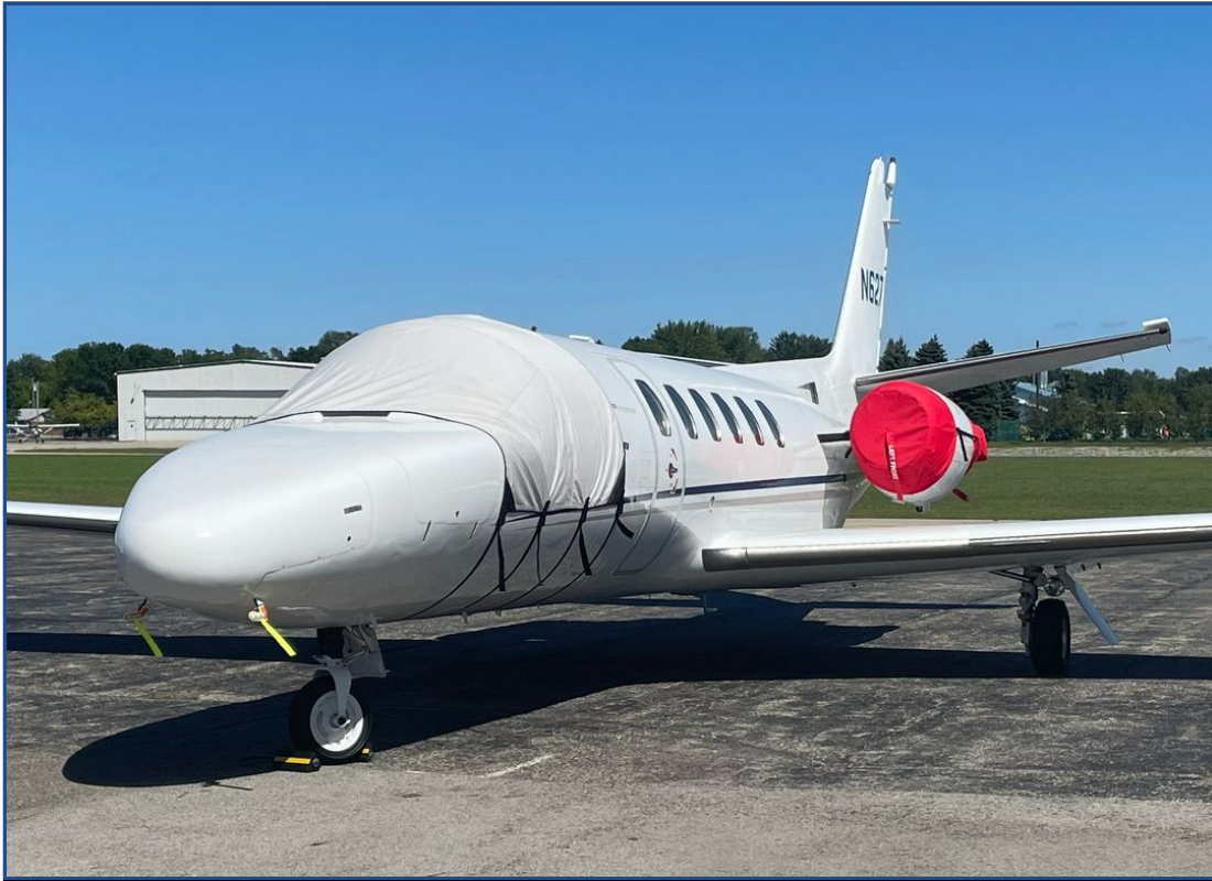
Cessna 550 Citation II