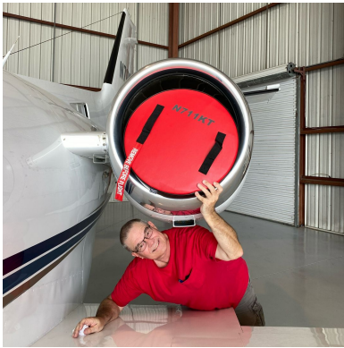
Citation II Engine Plugs

The Engine Inlet Plugs are custom fit for your Cessna Citation II (550, 551, UC-35A, with JT15D) intakes, made with heavy-duty vinyl material, and stuffed with a single block of sculpted urethane foam. Each plug has a zipper that allows the foam to be removed and dried if necessary. Engine plugs have 'remove before flight' streamers sewn onto the face of the plugs. Most plugs are imprinted with the aircraft registration number in black for an extra charge. Storage bag NOT included. Engine plugs may be inserted after flight when the engine is still warm. Engine Inlet Plugs are commonly referred to as Cowl Plugs, Intake Plugs, Cowl Blocks, Engine Blocks, and Engine Bungs.