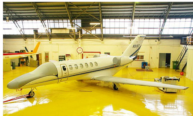
Cessna Citationjet CJ3 Cockpit/Nose, Engine &amp; Wings Travel Covers