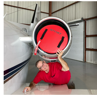
Citation II Engine Plugs