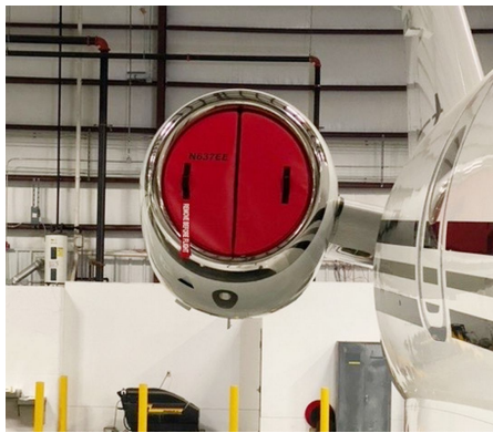
Embraer Legacy 500 Engine Inlet Plugs, folding type

The Engine Inlet Plugs are custom fit for your Cessna Citation II (550, 551, UC-35A, with JT15D) intakes, made with heavy-duty vinyl material, and stuffed with a single block of sculpted urethane foam. Each plug has a zipper that allows the foam to be removed and dried if necessary. Engine plugs have 'remove before flight' streamers sewn onto the face of the plugs. Most plugs are imprinted with the aircraft registration number in black for an extra charge. Storage bag NOT included. Engine plugs may be inserted after flight when the engine is still warm. Engine Inlet Plugs are commonly referred to as Cowl Plugs, Intake Plugs, Cowl Blocks, Engine Blocks, and Engine Bungs.