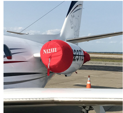
Cessna 551 Citation II SP Engine covers (with thrust reversers, smooth gen. inlet)