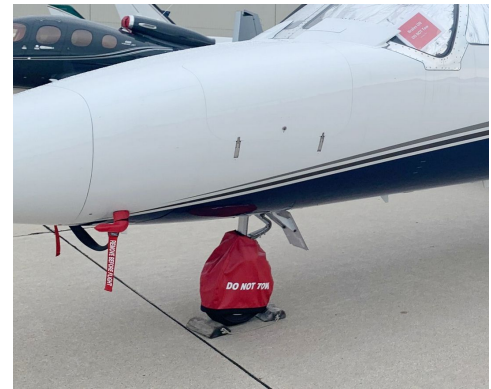
Cessna Citation Nose Tire Cover