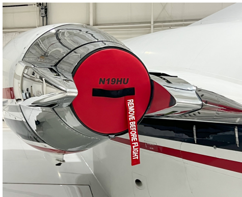
Citationjet V Ultra (560) Exhaust Plugs (set of 2)

The Engine Inlet Plugs are custom fit for your Cessna Citationjet V Ultra & Encore Models intakes, made with heavy-duty vinyl material, and stuffed with a single block of sculpted urethane foam. Each plug has a zipper that allows the foam to be removed and dried if necessary. Engine plugs have 'remove before flight' streamers sewn onto the face of the plugs. Most plugs are imprinted with the aircraft registration number in black for an extra charge. Storage bag NOT included. Engine plugs may be inserted after flight when the engine is still warm. Engine Inlet Plugs are commonly referred to as Cowl Plugs, Intake Plugs, Cowl Blocks, Engine Blocks, and Engine Bungs.