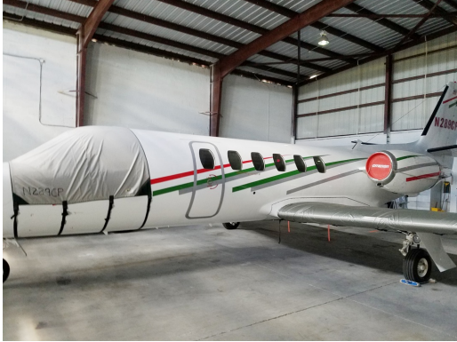
Cessna Citation II Cockpit Cover, Wing Covers

This cover type is made from Silver Acrylic Sunbrella canvas and is 100% lined with a soft and smooth microfiber. Bruce's Custom Covers developed this material combination especially for aircraft protection. The outer material is medium weight and treated for water resistance, UV resistance and anti-static buildup. The inner lining is a very soft and smooth microfiber to prevent scratching. The material is very reflective, and tests show that the cabin interior temperature can be reduced to near-ambient temperature on the hottest of days. It is water, ice and snow repellent, yet breathable to allow moisture to escape from between the cover and the aircraft surface.