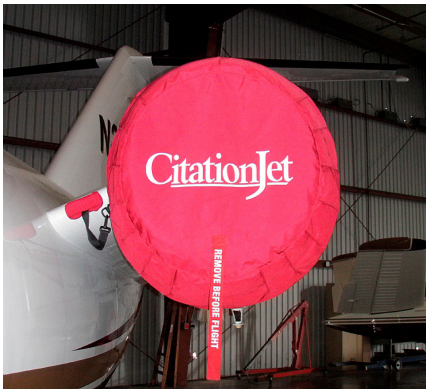
Cessna Citation Engine Cover Set

The Cessna Citationjet V Ultra & Encore Models Intake/Exhaust Plugs are custom fit for the intake and exhaust openings, made with heavy-duty vinyl material, and stuffed with a single block of sculpted urethane foam. Each plug has a zipper that allows the foam to be removed and dried if necessary. Engine plugs have 'remove before flight' streamers sewn onto the face of the plugs. Most plugs are imprinted with the aircraft registration number in black. Engine plugs may be inserted after flight when the engine is still warm. Engine Inlet Plugs are commonly referred to as Cowl Plugs, Intake Plugs, Cowl Blocks, Engine Blocks, and Engine Bungs.