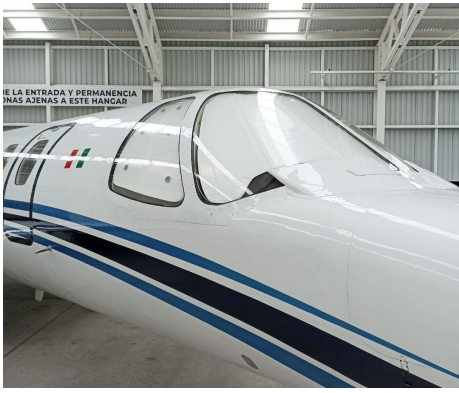
Cessna Citation I & II Cockpit HeatShields