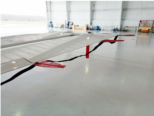
Cessna Citationjet V Ultra (560) Intake Plugs, With Pylon Plugs Hawker Beechcraft 800, 800XP, 850XP Static Wick Protectors