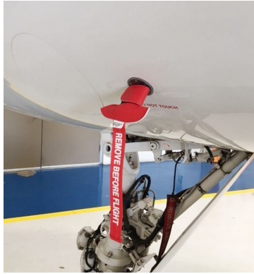
Grumman Gulfstream G-V Rosemont/TAT Cover

The Engine Inlet Plugs are custom fit for your Cessna Citationjet V Ultra (560) intakes, made with heavy-duty vinyl material, and stuffed with a single block of sculpted urethane foam. Each plug has a zipper that allows the foam to be removed and dried if necessary. Engine plugs have 'remove before flight' streamers sewn onto the face of the plugs. Most plugs are imprinted with the aircraft registration number in black for an extra charge. Storage bag NOT included. Engine plugs may be inserted after flight when the engine is still warm. Engine Inlet Plugs are commonly referred to as Cowl Plugs, Intake Plugs, Cowl Blocks, Engine Blocks, and Engine Bungs.