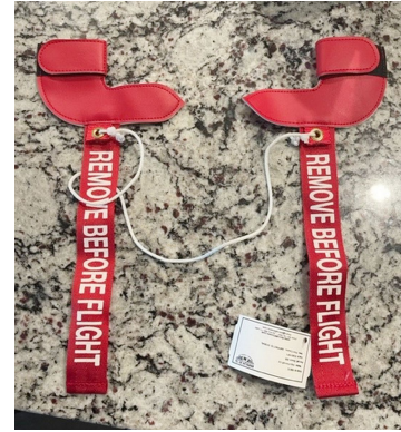
Cessna Citation Pitot Cover Set