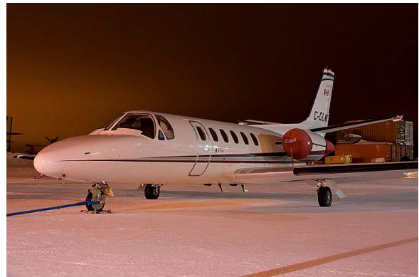
Cessna Citation 550 Engine Cover Set