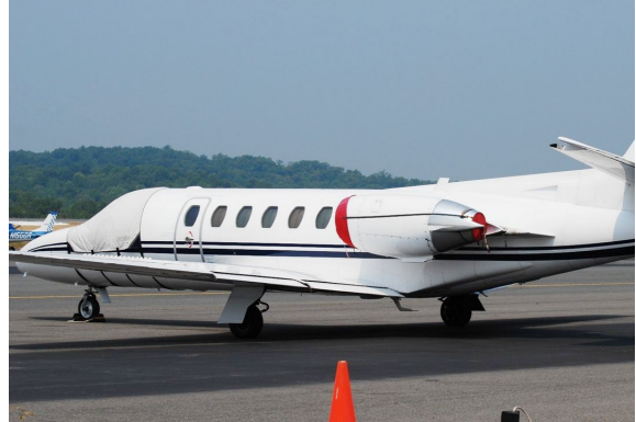
Cessna Citation S2 Cockpit Cover, Intake Covers & Exhaust Plugs