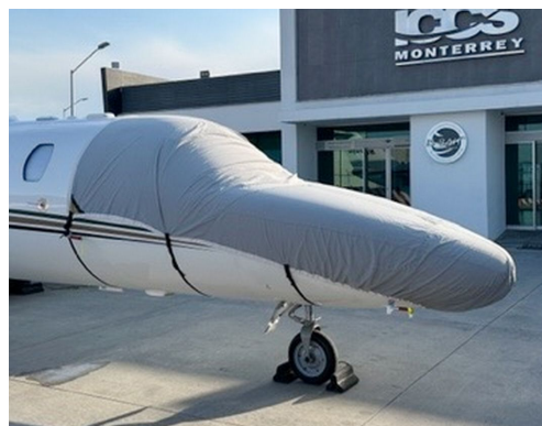
Cessna Citation Windshield Cover, Engine Cover set and Pitot Covers Cessna Citationjet 525B Travel Weight Cockpit/Nose Cover