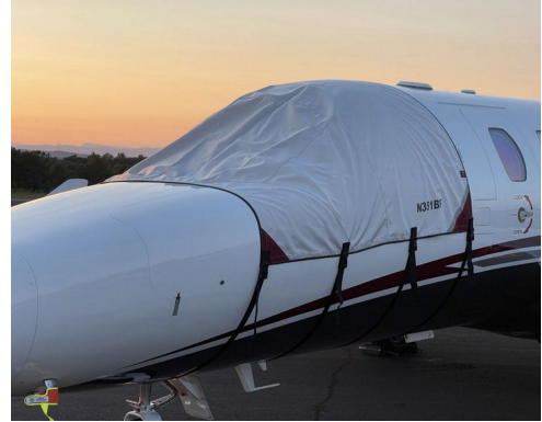
Cessna Citation Jet 525 Cockpit Cover