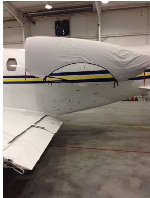
Cessna Citation 560XL Upper Nacelle/Brightwork Covers

The Cessna Citationjet V Ultra (560) Intake/Exhaust Plugs are custom fit for the intake and exhaust openings, made with heavy-duty vinyl material, and stuffed with a single block of sculpted urethane foam. Each plug has a zipper that allows the foam to be removed and dried if necessary. Engine plugs have 'remove before flight' streamers sewn onto the face of the plugs. Most plugs are imprinted with the aircraft registration number in black. Engine plugs may be inserted after flight when the engine is still warm. Engine Inlet Plugs are commonly referred to as Cowl Plugs, Intake Plugs, Cowl Blocks, Engine Blocks, and Engine Bungs.