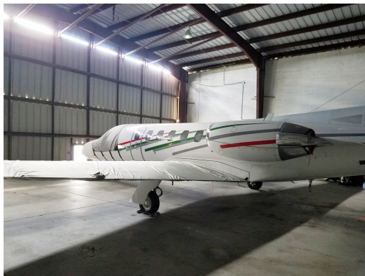
Cessna Citation II Cockpit Cover, Wing Covers

WINTER USE MATERIAL - Made with Solution-Dyed Polyester fabric, this option is intended for seasonal use to aid in deicing, rain mitigation, or for occasional travel. The material is lighter and more compact, but more susceptible to UV damage and may have a shorter useful life if used continuously outside than the all-year use material.