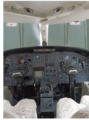
Cessna Citation I & II Cockpit HeatShields