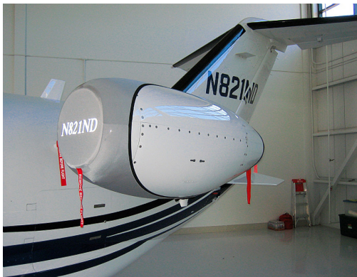
Cessna 510 Mustang Bikini Type Engine Cover

The Cessna Citation II Bravo Intake/Exhaust Plugs are custom fit for the intake and exhaust openings, made with heavy-duty vinyl material, and stuffed with a single block of sculpted urethane foam. Each plug has a zipper that allows the foam to be removed and dried if necessary. Engine plugs have 'remove before flight' streamers sewn onto the face of the plugs. Most plugs are imprinted with the aircraft registration number in black. Engine plugs may be inserted after flight when the engine is still warm. Engine Inlet Plugs are commonly referred to as Cowl Plugs, Intake Plugs, Cowl Blocks, Engine Blocks, and Engine Bungs.