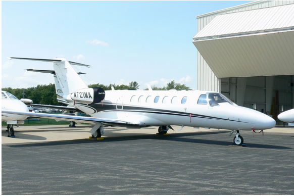
Cessna Citation CJ3 Bikini Style Engine Covers

The Cessna Citation II Bravo Intake/Exhaust Plugs are custom fit for the intake and exhaust openings, made with heavy-duty vinyl material, and stuffed with a single block of sculpted urethane foam. Each plug has a zipper that allows the foam to be removed and dried if necessary. Engine plugs have 'remove before flight' streamers sewn onto the face of the plugs. Most plugs are imprinted with the aircraft registration number in black. Engine plugs may be inserted after flight when the engine is still warm. Engine Inlet Plugs are commonly referred to as Cowl Plugs, Intake Plugs, Cowl Blocks, Engine Blocks, and Engine Bungs.