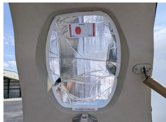
Citationjet Entrance Door Heatshield