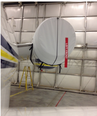
Cessna Citation 560XL Upper Nacelle/Brightwork Covers