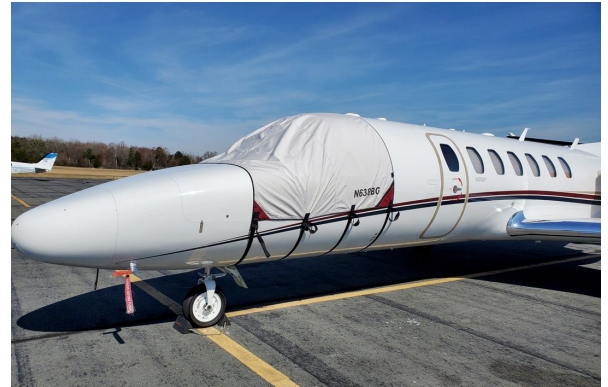
Cessna Citation 560 Cockpit Cover