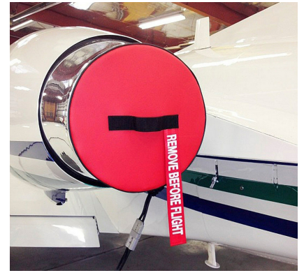
Cessna Citation S2 Exhaust Plugs