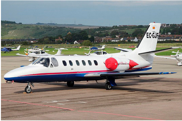
Cessna Citation II Engine Covers, Pitot Covers

The Cessna Citation II Bravo Intake/Exhaust Plugs are custom fit for the intake and exhaust openings, made with heavy-duty vinyl material, and stuffed with a single block of sculpted urethane foam. Each plug has a zipper that allows the foam to be removed and dried if necessary. Engine plugs have 'remove before flight' streamers sewn onto the face of the plugs. Most plugs are imprinted with the aircraft registration number in black. Engine plugs may be inserted after flight when the engine is still warm. Engine Inlet Plugs are commonly referred to as Cowl Plugs, Intake Plugs, Cowl Blocks, Engine Blocks, and Engine Bungs.