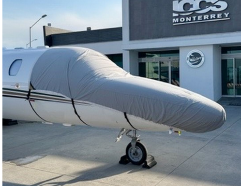
Cessna Citationjet 525B Travel Weight Cockpit/Nose Cover

This cover type is made from Silver Acrylic Sunbrella canvas and is 100% lined with a soft and smooth microfiber. Bruce's Custom Covers developed this material combination especially for aircraft protection. The outer material is medium weight and treated for water resistance, UV resistance and anti-static buildup. The inner lining is a very soft and smooth microfiber to prevent scratching. The material is very reflective, and tests show that the cabin interior temperature can be reduced to near-ambient temperature on the hottest of days. It is water, ice and snow repellent, yet breathable to allow moisture to escape from between the cover and the aircraft surface.