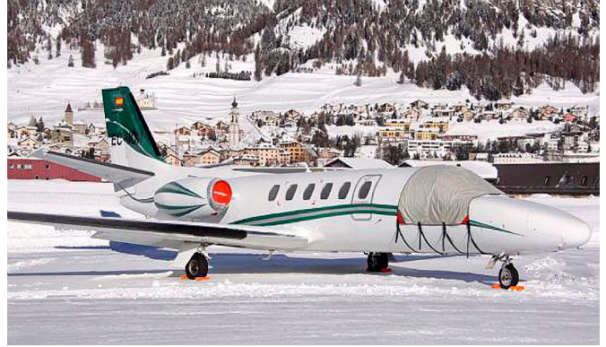
Cessna Citation 550 Windshield Cover