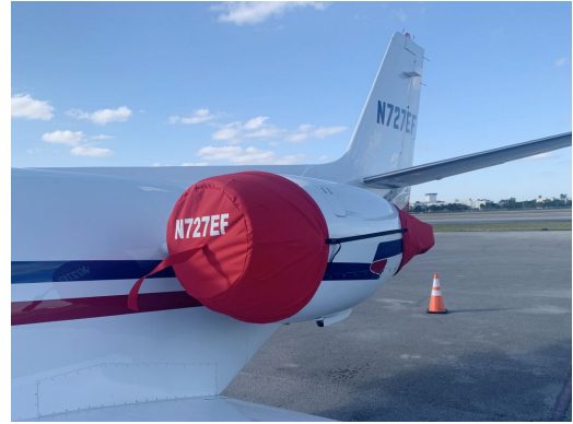
Cessna Citation S550