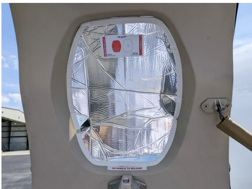
Citationjet Entrance Door Heatshield