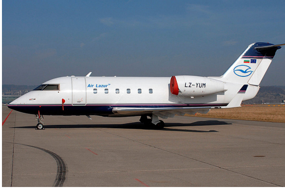
Challenger 600 Intake Covers

The Canadair Challenger 600 Intake Covers are designed to install easily yet be completely storable. A spring steel hoop is sewn into the hem of each cover, allowing them to be installed without climbing onto the wing or using a stepladder. To store the covers the spring steel hoop folds like a band-saw blade into three nesting rings. Each cover folds into a compact circular bundle which is stored in the included duffle bag, yet they unfold quickly for use. The Tri-Fold Ring cover is made of medium weight nylon which is available in a variety of colors to match the paint trim. Each cover set comes complete with installation and folding instructions. The aircraft's registration number can be silkscreened onto the cover for an extra charge.