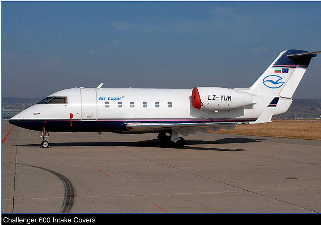
Challenger 600 Intake Covers