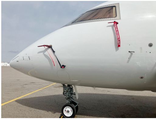
Challenger 650 Pitot & Ice Detector Covers