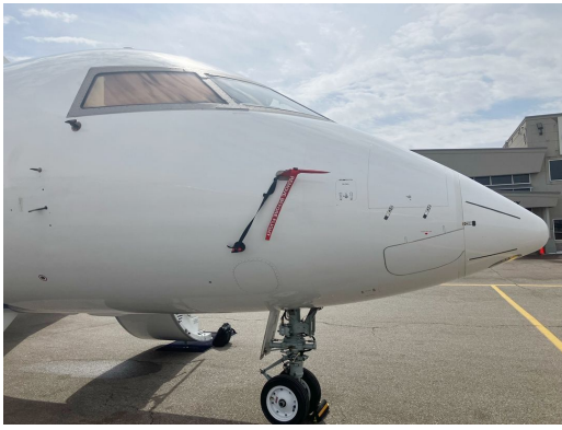
Challenger 650 Pitot & Ice Detector Covers