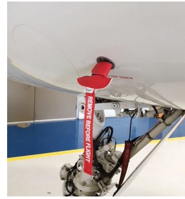
Grumman Gulfstream G-V Rosemont/TAT Cover