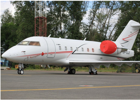
Canadair Challenger 601 Intake Covers