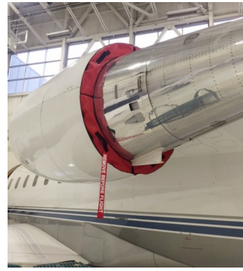
Canadair Challenger 604 Bypass Plugs