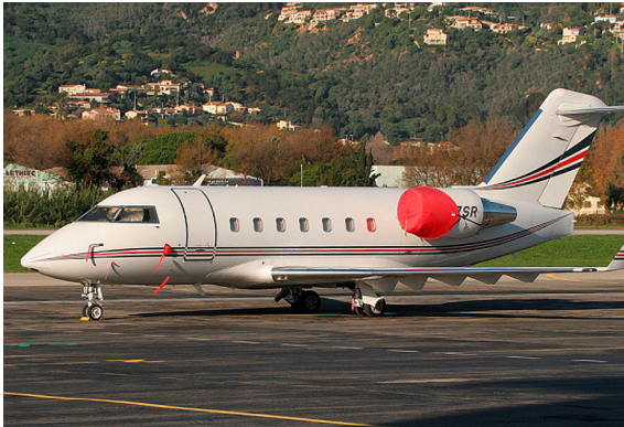
Challenger 601 Intake Covers, standard design

The Canadair Challenger 604, 605, 650, 850 Intake Covers are designed to install easily yet be completely storable. A spring steel hoop is sewn into the hem of each cover, allowing them to be installed without climbing onto the wing or using a stepladder. To store the covers the spring steel hoop folds like a band-saw blade into three nesting rings. Each cover folds into a compact circular bundle which is stored in the included duffel bag, yet they unfold quickly for use. The Tri-Fold Ring cover is made of medium weight nylon which is available in a variety of colors to match the paint trim. Each cover set comes complete with installation and folding instructions. The aircraft's registration number can be silkscreened onto the cover for an extra charge.