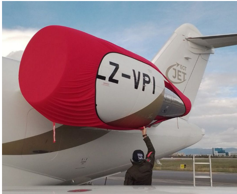
Challenger 605 Engine Covers, Bikini Type

The Canadair Challenger 604, 605, 650, 850 Intake Covers are designed to install easily yet be completely storable. A spring steel hoop is sewn into the hem of each cover, allowing them to be installed without climbing onto the wing or using a stepladder. To store the covers the spring steel hoop folds like a band-saw blade into three nesting rings. Each cover folds into a compact circular bundle which is stored in the included duffel bag, yet they unfold quickly for use. The Tri-Fold Ring cover is made of medium weight nylon which is available in a variety of colors to match the paint trim. Each cover set comes complete with installation and folding instructions. The aircraft's registration number can be silkscreened onto the cover for an extra charge.