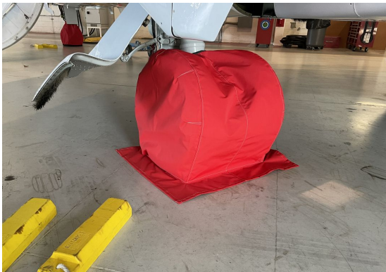
Canadair Challenger 605 Main Gear Tire Covers

ALL-YEAR USE MATERIAL - Made with Silver Acrylic Sunbrella canvas, the all-year use material is the best option for sun protection and cover longevity. This heavier more durable material is intended for all weather conditions, such as rain and snow or lots of sun.