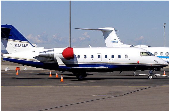
Challenger 604 Intake Covers, standard design