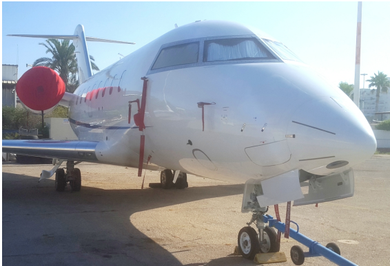
Canadair Challenger 604, 605, 650, 850 Intake Covers

The Canadair Challenger 604, 605, 650, 850 Intake Covers are designed to install easily yet be completely storable. A spring steel hoop is sewn into the hem of each cover, allowing them to be installed without climbing onto the wing or using a stepladder. To store the covers the spring steel hoop folds like a band-saw blade into three nesting rings. Each cover folds into a compact circular bundle which is stored in the included duffle bag, yet they unfold quickly for use. The Tri-Fold Ring cover is made of medium weight nylon which is available in a variety of colors to match the paint trim. Each cover set comes complete with installation and folding instructions. The aircraft's registration number can be silkscreened onto the cover for an extra charge.