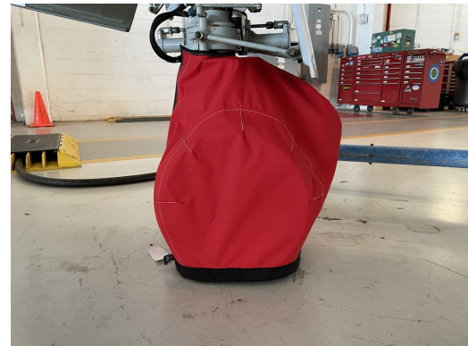
Canadair Challenger 605 Nose Gear Tire Cover