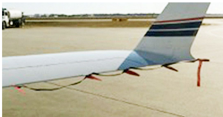
Static Wick Covers

with the aircraft registration number in black for an extra charge. Storage bag NOT included. Engine plugs may be inserted after flight when the engine is still warm. Engine Inlet Plugs are commonly referred to as Cowl Plugs, Intake Plugs, Cowl Blocks, Engine Blocks, and Engine Bungs.