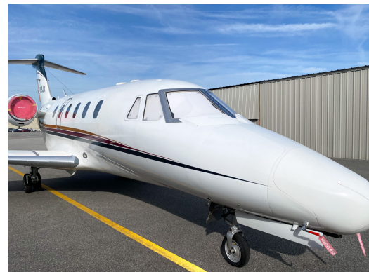
Cessna 650 Cockpit Heatshields (set of 6)