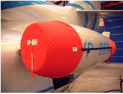
Falcon 900 Sovereign Engine Covers