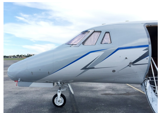
Cessna Citation 650 Cockpit HeataShields