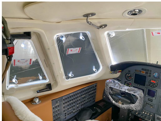
Cessna 650 Cockpit Heatshields (set of 6)

Cockpit Heatshields are interior sunshades for the aircraft's cockpit. The product is a unique composite of closed-cell foam with a silver mylar finish. The semi-rigid design is stiff enough to stand inside the window framing. The set folds up flat and is easily stored in the included storage sleeve. Some designs may require velcro and suction cups. Our Heatshields for jets are offered white side out because some aircraft manufacturers have issued advisories against reflective window inserts due to potential heat damage. A Heatshield is an excellent short-term remedy for cockpit overheating, but an external fabric cover is more effective for long-term protection.