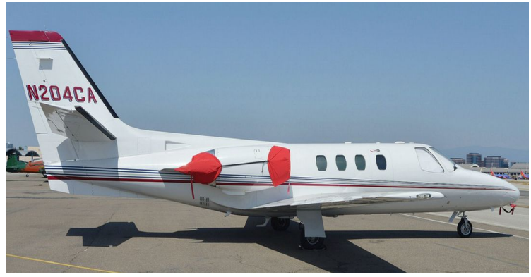
Cessna Citation Engine Covers and Heatshields