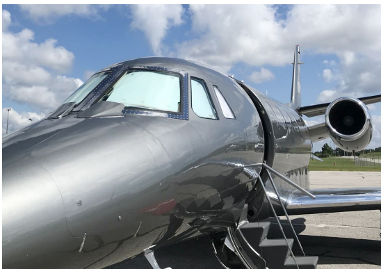
Cessna Citation 560XL Cockpit HeatShields

Cockpit Heatshields are interior sunshades for the aircraft's cockpit. The product is a unique composite of closed-cell foam with a silver mylar finish. The semi-rigid design is stiff enough to stand inside the window framing. The set folds up flat and is easily stored in the included storage sleeve. Some designs may require velcro and suction cups. Our Heatshields for jets are offered white side out because some aircraft manufacturers have issued advisories against reflective window inserts due to potential heat damage. A Heatshield is an excellent short-term remedy for cockpit overheating, but an external fabric cover is more effective for long-term protection.