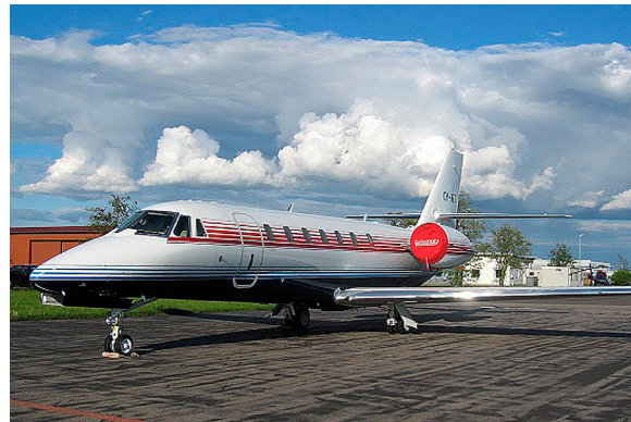
Citation Sovereign Engine Covers