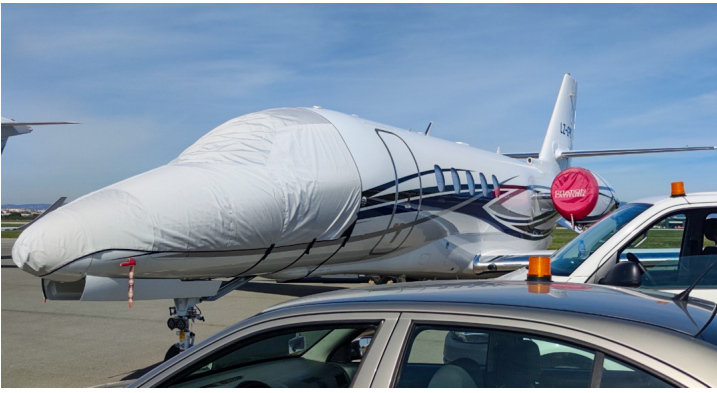
Cessna Citation Latitude (680A) Cockpit/Nose Cover, Doesn't Cover Pitot Tubes