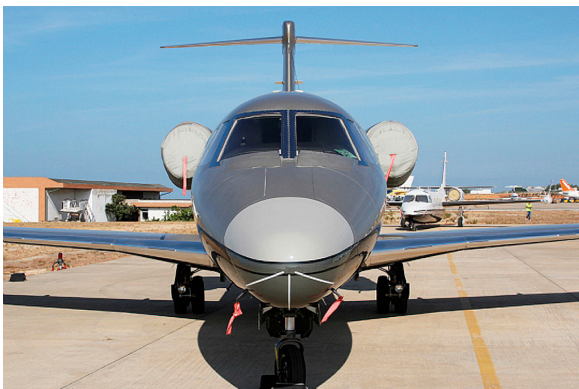
Citation III 650 Engine Covers Set

The Cessna Citation Latitude (680A) Intake/Exhaust Plugs are custom fit for the intake and exhaust openings, made with heavy-duty vinyl material, and stuffed with a single block of sculpted urethane foam. Each plug has a zipper that allows the foam to be removed and dried if necessary. Engine plugs have 'remove before flight' streamers sewn onto the face of the plugs. Most plugs are imprinted with the aircraft registration number in black. Engine plugs may be inserted after flight when the engine is still warm. Engine Inlet Plugs are commonly referred to as Cowl Plugs, Intake Plugs, Cowl Blocks, Engine Blocks, and Engine Bungs.