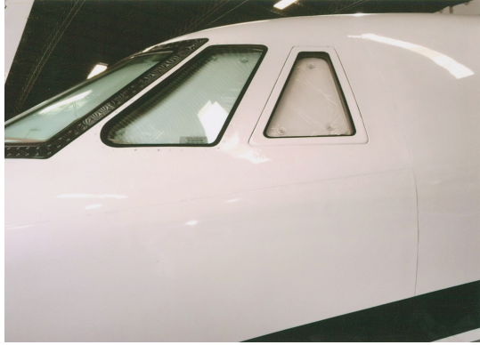
Citation XL Cockpit HeatShields

Cockpit Heatshields are interior sunshades for the aircraft's cockpit. The product is a unique composite of closed-cell foam with a silver mylar finish. The semi-rigid design is stiff enough to stand inside the window framing. The set folds up flat and is easily stored in the included storage sleeve. Some designs may require velcro and suction cups. Our Heatshields for jets are offered white side out because some aircraft manufacturers have issued advisories against reflective window inserts due to potential heat damage. A Heatshield is an excellent short-term remedy for cockpit overheating, but an external fabric cover is more effective for long-term protection.