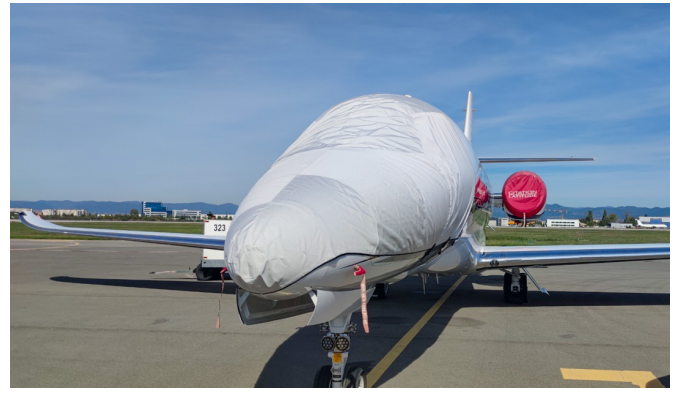
Cessna Citation Latitude (680A) Cockpit/Nose Cover, Doesn't Cover Pitot Tubes