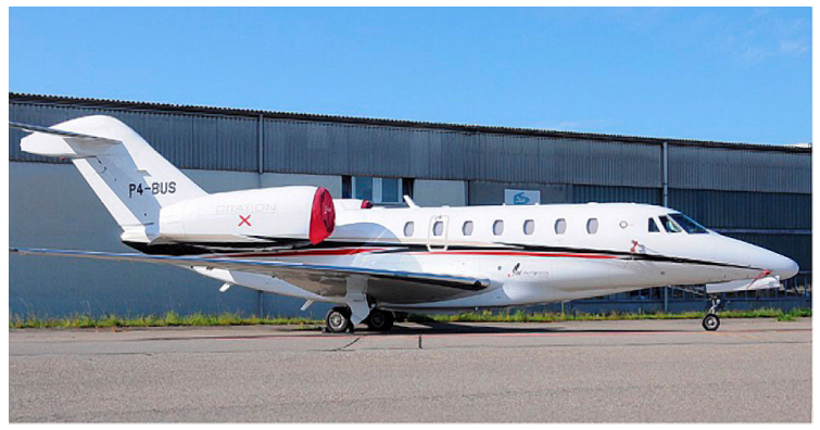
Citation X Intake & Pitot Tube Covers