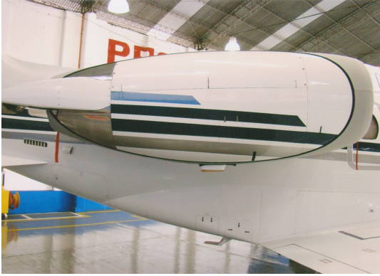
Citation XL Bikini Style Engine Covers

which is stored in the included duffle bag, yet they unfold quickly for use. The Tri-Fold Ring cover is made of medium weight nylon which is available in a variety of colors to match the paint trim. Each cover set comes complete with installation and folding instructions. The aircraft's registration number can be silkscreened onto the cover for an extra charge.