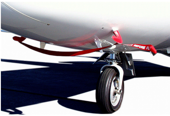
Cessna Citation I Pitot Covers