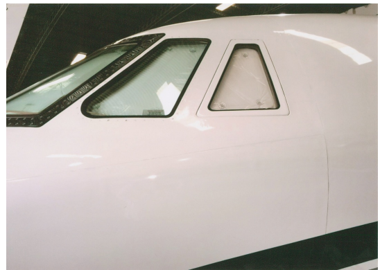
Citation XL Cockpit HeatShields