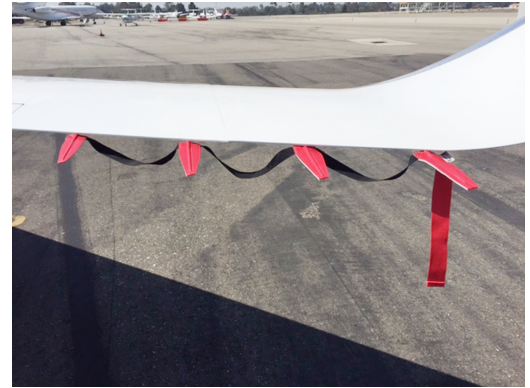
Citation X Static Wick Protectors