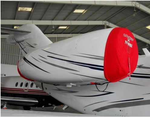
Citation X Intake/Exhaust Cover Set