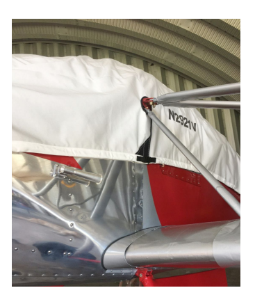
Callair A-2 Canopy Cover