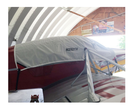
Callair A-2 Canopy Cover

Canopy Covers are commonly referred to as Cabin Covers, Fuselage Covers, Canvas Covers, Canopy Caps, etc.