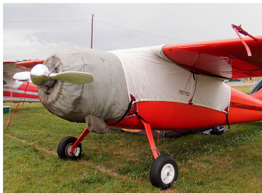
Cessna 195 Over-Top Canopy Cover & Engine Cover