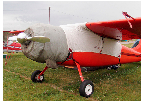
Cessna 195 Over-Top Canopy Cover & Engine Cover