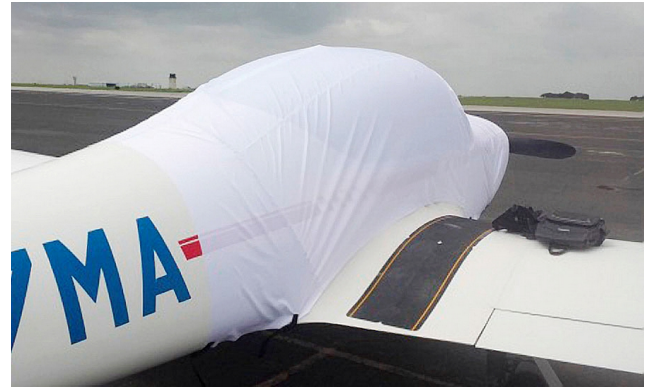
Taifun 17E Canopy/Engine Cover, test fit cover