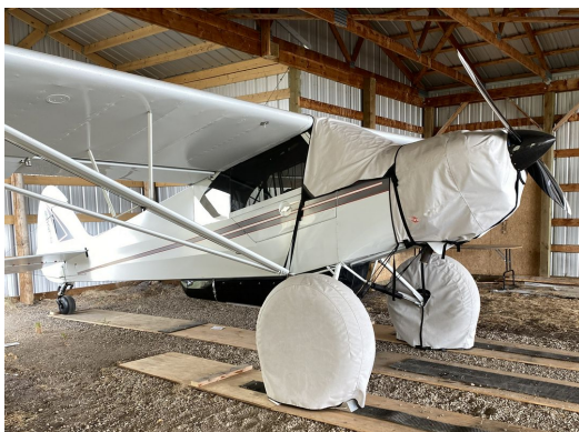
CubCrafters CC-11 Windshield, Engine & Tire Covers

This cover type is made from Silver Acrylic Sunbrella canvas and is 100% lined with a soft and smooth microfiber. Bruce's Custom Covers developed this material combination especially for aircraft protection. The outer material is medium weight and treated for water resistance, UV resistance and anti-static buildup. The inner lining is a very soft and smooth microfiber to prevent scratching. The material is very reflective, and tests show that the cabin interior temperature can be reduced to near-ambient temperature on the hottest of days. It is water, ice and snow repellent, yet breathable to allow moisture to escape from between the cover and the aircraft surface.