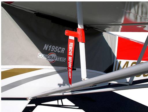
Cub Crafters Sport Cub Pitot Cover

Engine Inlet Plugs are custom fit for your CubCrafters CC-11, Sport Cub S2, & Carbon Cub intakes, made with heavy-duty vinyl material, and stuffed with a single block of sculpted urethane foam. Each plug has a zipper that allows the foam to be removed and dried if necessary. Engine plugs have warning flags that are visible from the cockpit or 'remove before flight' streamers sewn onto the face of the plugs. Most plugs are imprinted with the aircraft registration number in black for an extra charge. Storage bag NOT included. Engine plugs may be inserted after flight when the engine is still warm. Engine Inlet Plugs are commonly referred to as Cowl Plugs, Intake Plugs, Cowl Blocks, Engine Blocks, and Engine Bunges.