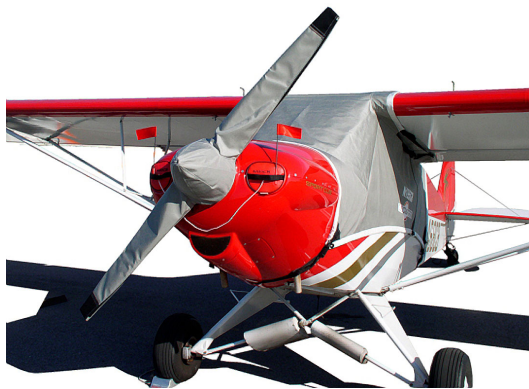
Cub Crafters Sport Cub Prop Cover & Engine Plugs