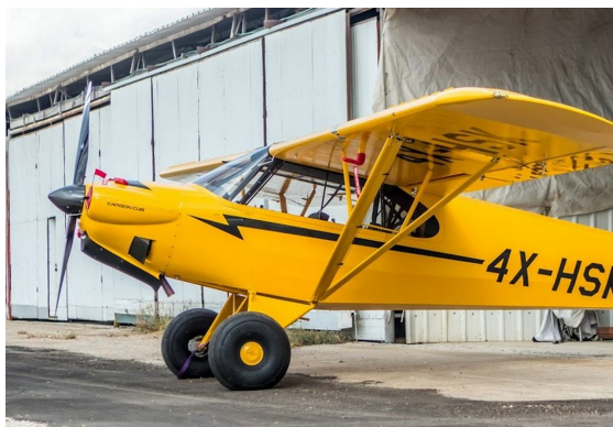
Cub Crafters Carbon Cub SS Engine Inlet Plugs & Pitot Cover

Engine Inlet Plugs are custom fit for your CubCrafters CC-18, 19, 20, Top Cub, CCK-1865, CC-19 X-Cub, CCX-2000, EX-3, FX-3 intakes, made with heavy-duty vinyl material, and stuffed with a single block of sculpted urethane foam. Each plug has a zipper that allows the foam to be removed and dried if necessary. Engine plugs have warning flags that are visible from the cockpit or 'remove before flight' streamers sewn onto the face of the plugs. Most plugs are imprinted with the aircraft registration number in black for an extra charge. Storage bag NOT included. Engine plugs may be inserted after flight when the engine is still warm. Engine Inlet Plugs are commonly referred to as Cowl Plugs, Intake Plugs, Cowl Blocks, Engine Blocks, and Engine Bungs.