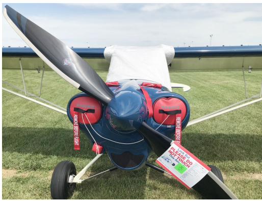
Cub Crafters EX2 Canopy Cover, Engine Plugs