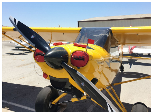
Cub Crafters CC-11 Carbon Cub Engine Plugs