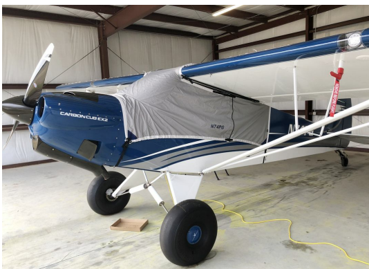
Cub Crafters Carbon Cub Travel Weight Canopy Cover

This cover type is made from Silver Acrylic Sunbrella canvas and is 100% lined with a soft and smooth microfiber. Bruce's Custom Covers developed this material combination especially for aircraft protection. The outer material is medium weight and treated for water resistance, UV resistance and anti-static buildup. The inner lining is a very soft and smooth microfiber to prevent scratching. The material is very reflective, and tests show that the cabin interior temperature can be reduced to near-ambient temperature on the hottest of days. It is water, ice and snow repellent, yet breathable to allow moisture to escape from between the cover and the aircraft surface.