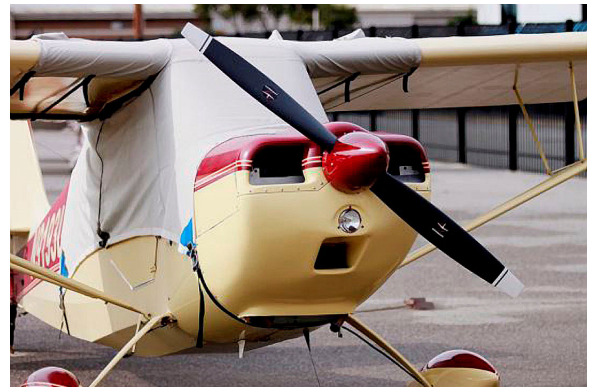
Bellanca Citabria Over-the-Top Canopy Cover, extended to cover gas caps