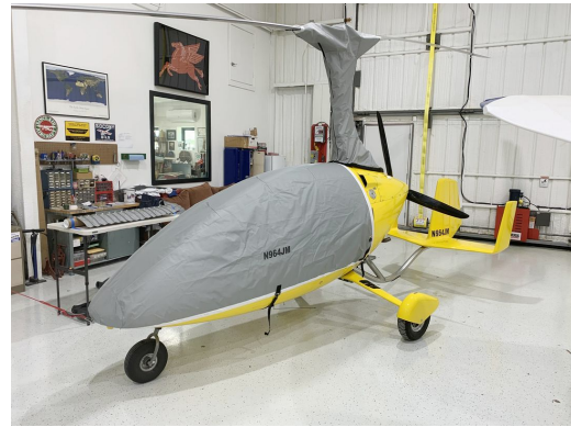
Autogyro Calidus Gyrocopter Rotor Hub/Mast Cover