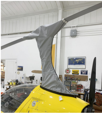
Autogyro Calidus Gyrocopter Rotor Hub/Mast Cover

Rotor Hub Covers overlaps with the Blade Covers to ensure complete protection for the entire main rotor system. Designed like a jacket with sleeves and no collar, the rotor hub cover fastens together below each blade with Delrin buckles. The Rotor Hub Cover is normally made from Solution-Dyed Polyester.