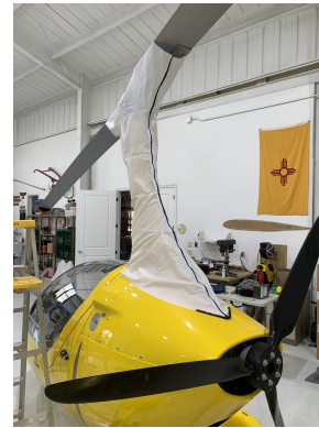
Calidus Gyrocopter Rotor Mast Cover, test fit cover