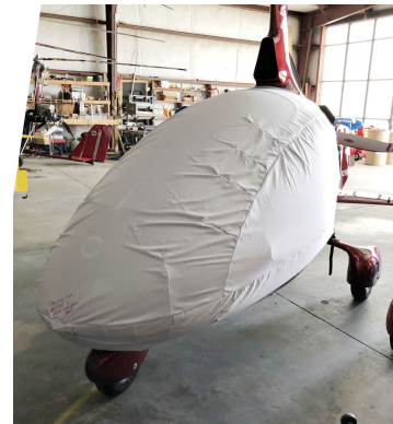
Cavalon Gyrocopter Bubble Cover, test fit cover