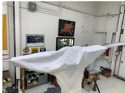
Calidus Gyrocopter Rotor Mast Cover, test fit cover