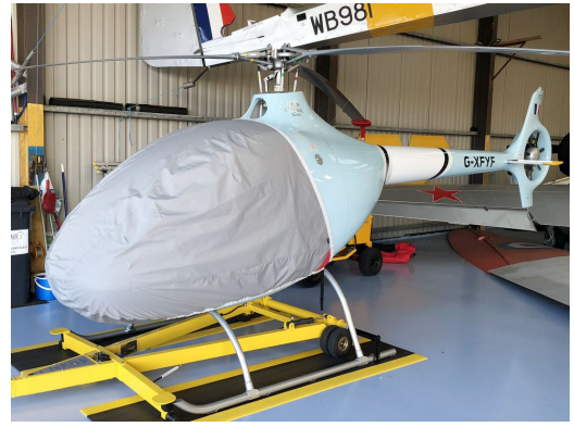
Cabri G2 Light Weight Travel Bubble Cover