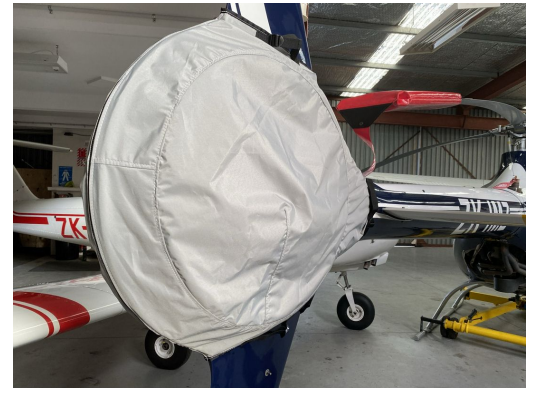
Guimbal Cabri G2 Tailfan Housing Fenestron Cover