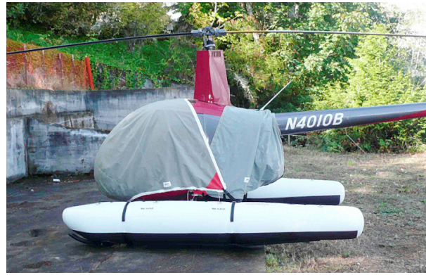
Robinson R-22 Standard Bubble Cover & Engine Cover