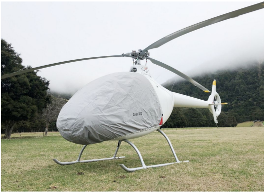
Guimbal Cabri CG2 Bubble Cover, light weight travel type