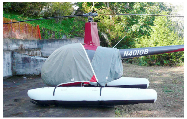
Robinson R-22 Standard Bubble Cover & Engine Cover