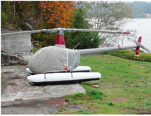
Robinson R-22 Bubble Cover (Ext. Past Rotor Hub), Engine Cover, Tailboom Cover, Blade Covers, Rotor Hub Cover, & Tail Rotor Gear Box Cover