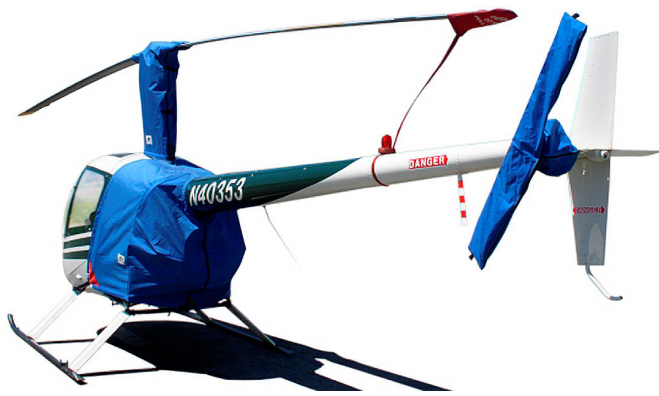
Robinson R-22 Engine, Rotor Mast & Tail Rotor Covers, with Blade Tie-down