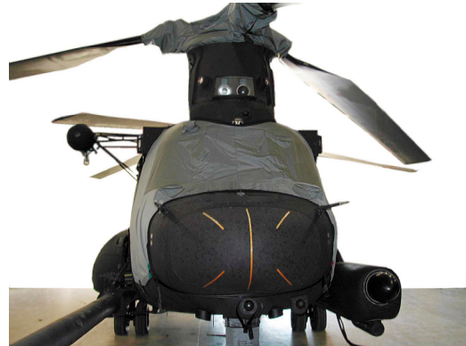
Boeing Vertol CH-47 Forward Cabin & Rotor Hub Cover