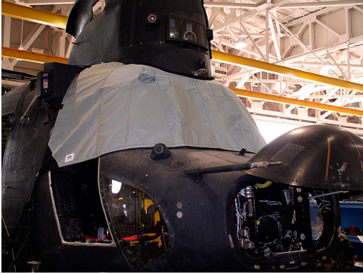
Boeing Vertol CH-47 Windshield/Cockpit Cover

water resistance, UV resistance and anti-static buildup. The inner lining is a very soft and smooth microfiber to prevent scratching. The material is very reflective, and tests show that the cabin interior temperature can be reduced to near-ambient temperature on the hottest of days. It is water, ice and snow repellent, yet breathable to allow moisture to escape from between the cover and the aircraft surface.