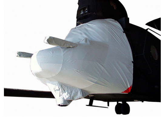
Spec. Op's CH-47: refuel boom, FLIR dome