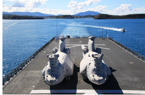
Boeing Vertol CH-47 Chinook Forward Cabin/Nose Cover