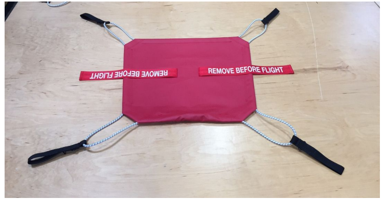
Boeing Vertol CH-47 Forward Cabin & Rotor Hub Cover