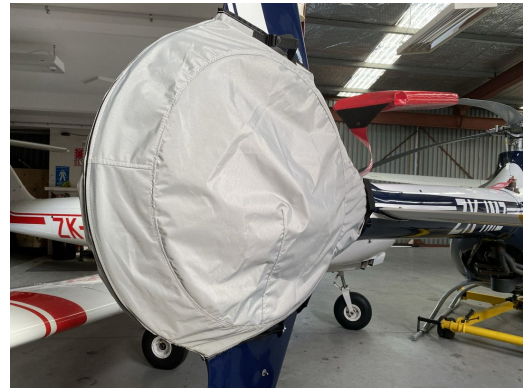
Guimbal Cabri G2 Tailfan Housing Fenestron Cover