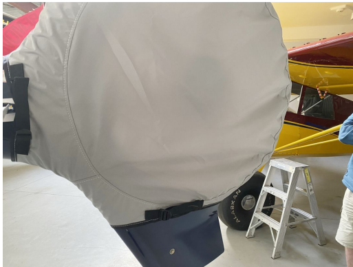
Guimbal Cabri G2 Tailfan Housing Fenestron Cover

WINTER USE MATERIAL - Made with Solution-Dyed Polyester fabric, this option is intended for seasonal use to aid in deicing, rain mitigation, or for occasional travel. The material is lighter and more compact, but more susceptible to UV damage and may have a shorter useful life if used continuously outside than the all-year use material.