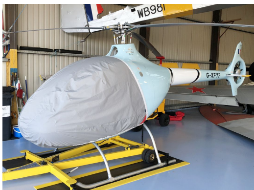
Cabri G2 Light Weight Travel Bubble Cover

Travel Covers are made with Silver Solution-Dyed Polyester fabric and fully lined over the entire cover. The material is lightweight and more compact for easy storage in the aircraft. The polyester material is water resistant, but only intended for occasional use outside. We also have an ultra lightweight material available for fitted hangar dust covers. For daily outdoor use, the non-travel Sunbrella Cover is the best choice.