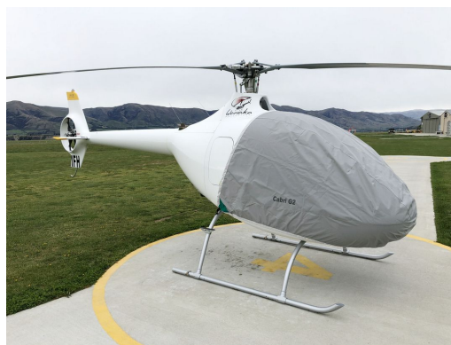
Guimbal Cabri CG2 Bubble Cover, light weight travel type