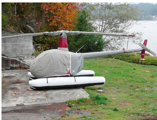
Robinson R-22 Bubble Cover (Ext. Past Rotor Hub), Engine Cover, Tailboom Cover, Blade Covers, Rotor Hub Cover, & Tail Rotor Gear Box Cover