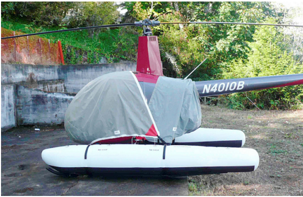
Robinson R-22 Standard Bubble Cover & Engine Cover

WINTER USE MATERIAL - Made with Solution-Dyed Polyester fabric, this option is intended for seasonal use to aid in deicing, rain mitigation, or for occasional travel. The material is lighter and more compact, but more susceptible to UV damage and may have a shorter useful life if used continuously outside than the all-year use material.