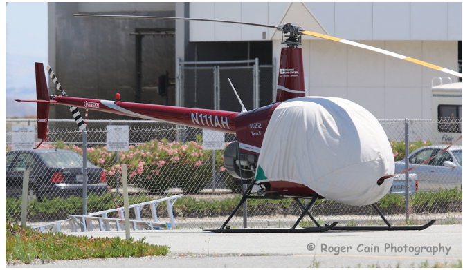
Robinson R-22 Standard Bubble Cover