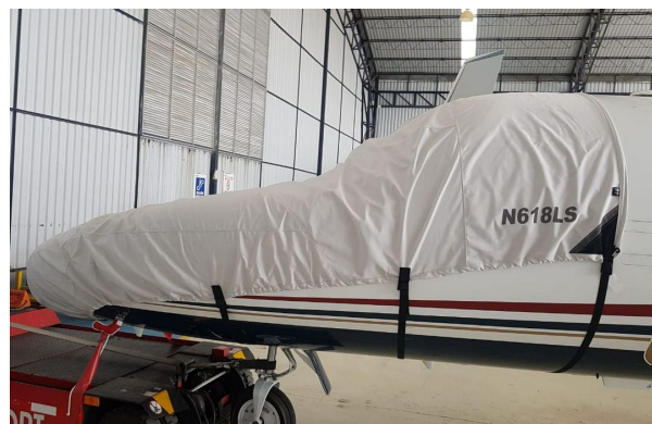
Citationjet 525B Cockpit/Nose Cover