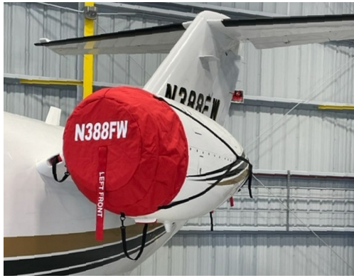
Cessna Citationjet 525 Intake Cover with Plugs