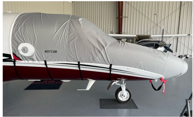
Cessna Citationjet M2 Light Weight Travel Cockpit/Nose Cover