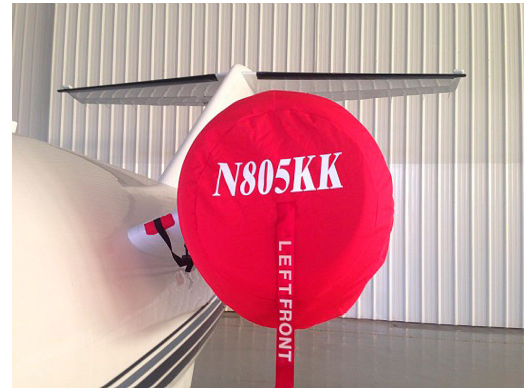
Cessna CJ1 Intake Cover and Inlet Plug