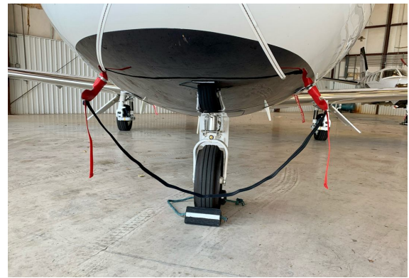
Cessna Citationjet CJ1 Pitot Cover Set