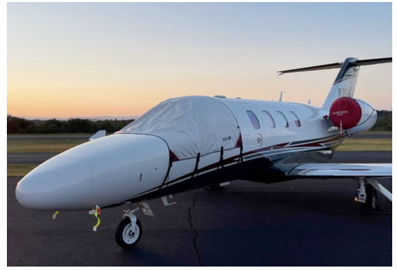
Cessna Citation Jet 525 Cockpit Cover