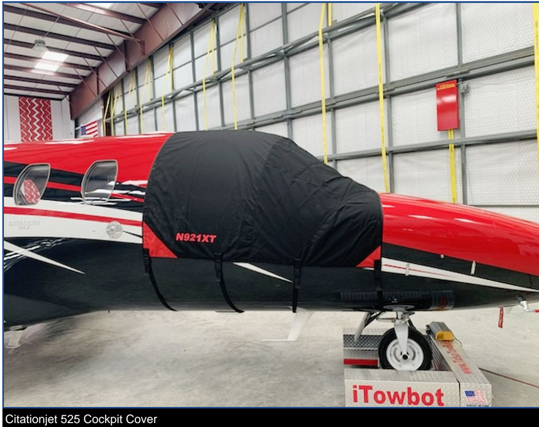
Citationjet 525 Cockpit Cover