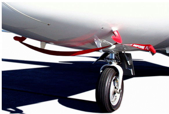
Cessna Citation I Pitot Covers

The Engine Inlet Plugs are custom fit for your Cessna Citationjet 525A, CJ-2, & CJ2+ intakes, made with heavy-duty vinyl material, and stuffed with a single block of sculpted urethane foam. Each plug has a zipper that allows the foam to be removed and dried if necessary. Engine plugs have 'remove before flight' streamers sewn onto the face of the plugs. Most plugs are imprinted with the aircraft registration number in black for an extra charge. Storage bag NOT included. Engine plugs may be inserted after flight when the engine is still warm. Engine Inlet Plugs are commonly referred to as Cowl Plugs, Intake Plugs, Cowl Blocks, Engine Blocks, and Engine Bunges.