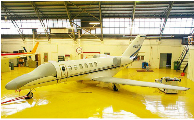
Cessna Citationjet CJ3 Cockpit/Nose, Engine & Wings Travel Covers