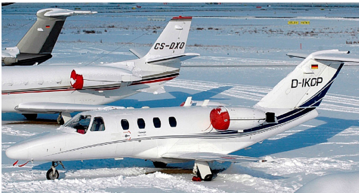
Engine Inlet Covers

The Cessna Citationjet 525A, CJ-2, & CJ2+ Intake/Exhaust Plugs are custom fit for the intake and exhaust openings, made with heavy-duty vinyl material, and stuffed with a single block of sculpted urethane foam. Each plug has a zipper that allows the foam to be removed and dried if necessary. Engine plugs have 'remove before flight' streamers sewn onto the face of the plugs. Most plugs are imprinted with the aircraft registration number in black. Engine plugs may be inserted after flight when the engine is still warm. Engine Inlet Plugs are commonly referred to as Cowl Plugs, Intake Plugs, Cowl Blocks, Engine Blocks, and Engine Bungs.