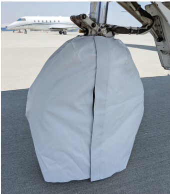
CJ1 Nose Gear Tire Cover, test fit

ALL-YEAR USE MATERIAL - Made with Silver Acrylic Sunbrella canvas, the all-year use material is the best option for sun protection and cover longevity. This heavier more durable material is intended for all weather conditions, such as rain and snow or lots of sun.