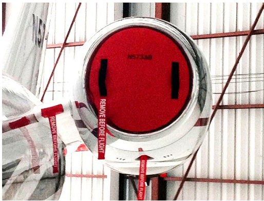
Citation CJ4 Intake Plugs pair

The Engine Inlet Plugs are custom fit for your Cessna Citationjet 525A, CJ-2, & CJ2+ intakes, made with heavy-duty vinyl material, and stuffed with a single block of sculpted urethane foam. Each plug has a zipper that allows the foam to be removed and dried if necessary. Engine plugs have 'remove before flight' streamers sewn onto the face of the plugs. Most plugs are imprinted with the aircraft registration number in black for an extra charge. Storage bag NOT included. Engine plugs may be inserted after flight when the engine is still warm. Engine Inlet Plugs are commonly referred to as Cowl Plugs, Intake Plugs, Cowl Blocks, Engine Blocks, and Engine Bungs.