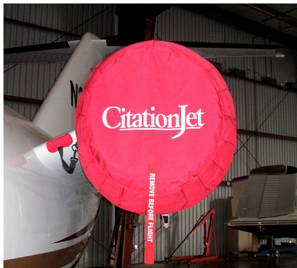
Cessna Citation Engine Cover Set

The Cessna Citationjet 525A, CJ-2, & CJ2+ Intake/Exhaust Plugs are custom fit for the intake and exhaust openings, made with heavy-duty vinyl material, and stuffed with a single block of sculpted urethane foam. Each plug has a zipper that allows the foam to be removed and dried if necessary. Engine plugs have 'remove before flight' streamers sewn onto the face of the plugs. Most plugs are imprinted with the aircraft registration number in black. Engine plugs may be inserted after flight when the engine is still warm. Engine Inlet Plugs are commonly referred to as Cowl Plugs, Intake Plugs, Cowl Blocks, Engine Blocks, and Engine Bungs.