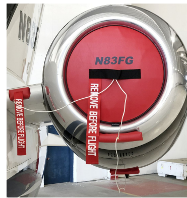
Cessna Citation Mustang 510 Engine Plugs