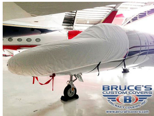
Cessna Citationjet 525B Travel Weight Cockpit/Nose Cover Citation CJ4 Cockpit/Nose Cover and Heat Resistant Pitot Covers set