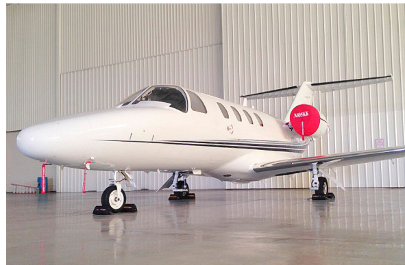
Cessna CJ1 Intake Cover