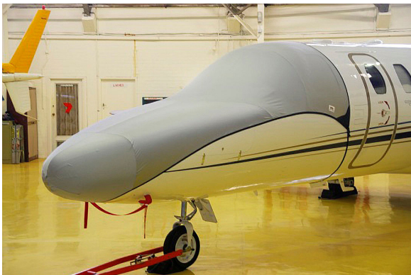
Citationjet CJ3 Cockpit/Nose Travel Cover

This cover type is made from Silver Acrylic Sunbrella canvas and is 100% lined with a soft and smooth microfiber. Bruce's Custom Covers developed this material combination especially for aircraft protection. The outer material is medium weight and treated for water resistance, UV resistance and anti-static buildup. The inner lining is a very soft and smooth microfiber to prevent scratching. The material is very reflective, and tests show that the cabin interior temperature can be reduced to near-ambient temperature on the hottest of days. It is water, ice and snow repellent, yet breathable to allow moisture to escape from between the cover and the aircraft surface.