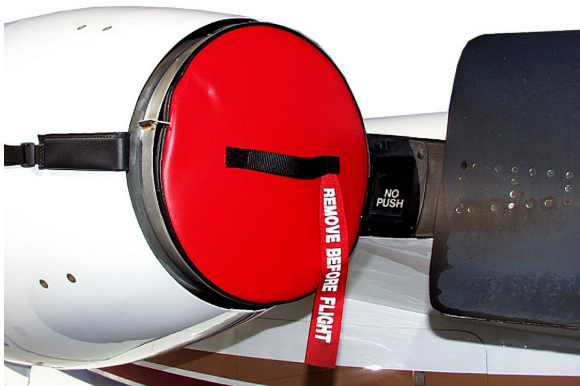
Engine Exhaust Plug

The Cessna Citationjet 525B, CJ-3 Intake/Exhaust Plugs are custom fit for the intake and exhaust openings, made with heavy-duty vinyl material, and stuffed with a single block of sculpted urethane foam. Each plug has a zipper that allows the foam to be removed and dried if necessary. Engine plugs have 'remove before flight' streamers sewn onto the face of the plugs. Most plugs are imprinted with the aircraft registration number in black. Engine plugs may be inserted after flight when the engine is still warm. Engine Inlet Plugs are commonly referred to as Cowl Plugs, Intake Plugs, Cowl Blocks, Engine Blocks, and Engine Bungs.