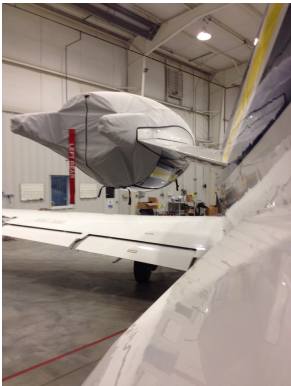
Cessna Citation 560XL Upper Nacelle/Brightwork Covers