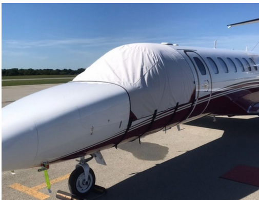
Cessna Citation Jet 525B Cockpit cover

This cover type is made from Silver Acrylic Sunbrella canvas and is 100% lined with a soft and smooth microfiber. Bruce's Custom Covers developed this material combination especially for aircraft protection. The outer material is medium weight and treated for water resistance, UV resistance and anti-static buildup. The inner lining is a very soft and smooth microfiber to prevent scratching. The material is very reflective, and tests show that the cabin interior temperature can be reduced to near-ambient temperature on the hottest of days. It is water, ice and snow repellent, yet breathable to allow moisture to escape from between the cover and the aircraft surface.