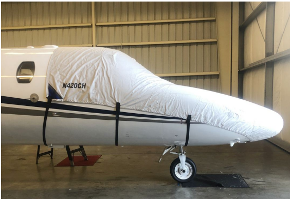
Cessna Citationjet CJ3 Cockpit/Nose Cover

This cover type is made from Silver Acrylic Sunbrella canvas and is 100% lined with a soft and smooth microfiber. Bruce's Custom Covers developed this material combination especially for aircraft protection. The outer material is medium weight and treated for water resistance, UV resistance and anti-static buildup. The inner lining is a very soft and smooth microfiber to prevent scratching. The material is very reflective, and tests show that the cabin interior temperature can be reduced to near-ambient temperature on the hottest of days. It is water, ice and snow repellent, yet breathable to allow moisture to escape from between the cover and the aircraft surface.