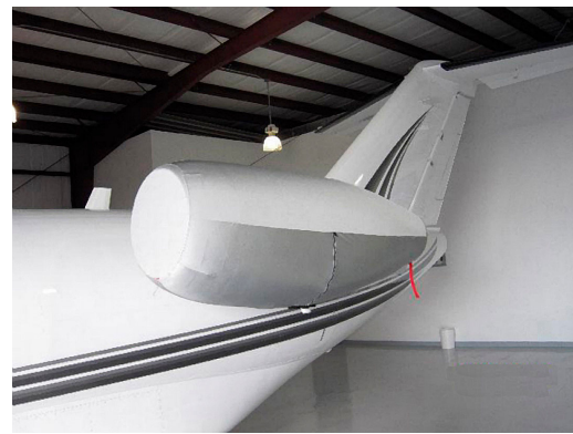
Citation CJ3 Bikini Style Engine Cover Set, full nacelle enclosure