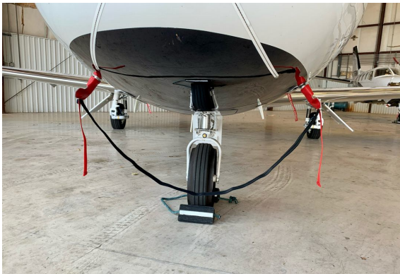
Cessna Citationjet CJ1 Pitot Cover Set