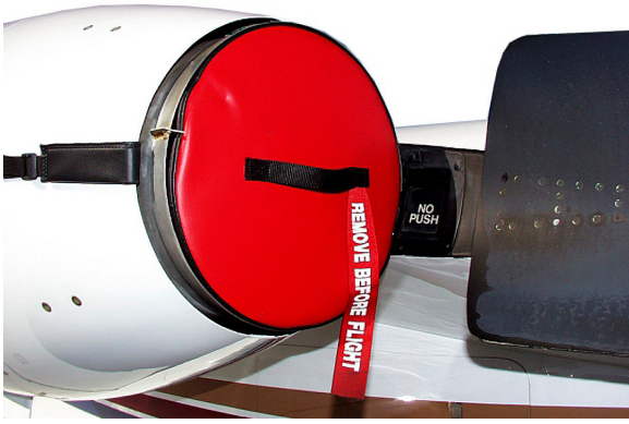
Engine Exhaust Plug