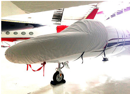
Citation CJ4 Cockpit/Nose Cover and Heat Resistant Pitot Covers set