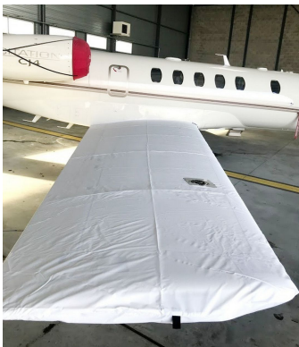
Cessna Citation CJ-4 Wing Covers, test fit cover