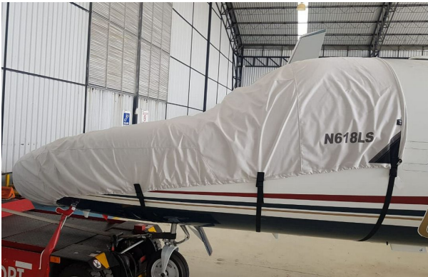
Citationjet 525B Cockpit/Nose Cover

This cover type is made from Silver Acrylic Sunbrella canvas and is 100% lined with a soft and smooth microfiber. Bruce's Custom Covers developed this material combination especially for aircraft protection. The outer material is medium weight and treated for water resistance, UV resistance and anti-static buildup. The inner lining is a very soft and smooth microfiber to prevent scratching. The material is very reflective, and tests show that the cabin interior temperature can be reduced to near-ambient temperature on the hottest of days. It is water, ice and snow repellent, yet breathable to allow moisture to escape from between the cover and the aircraft surface.