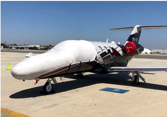
Citationjet CJ1 Cockpit/Nose Cover