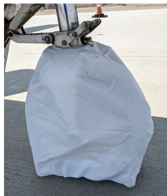
CJ1 Nose Gear Tire Cover, test fit