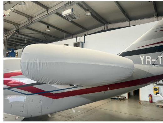
Citationjet 525C, CJ4, Complete Nacelle Cover, light weight Spandex