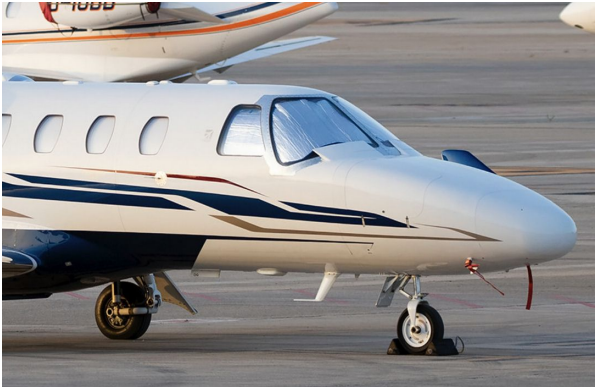
Cessna Citationjet 525, CJ-I, CJ1+, & M2 Cockpit Heatshields