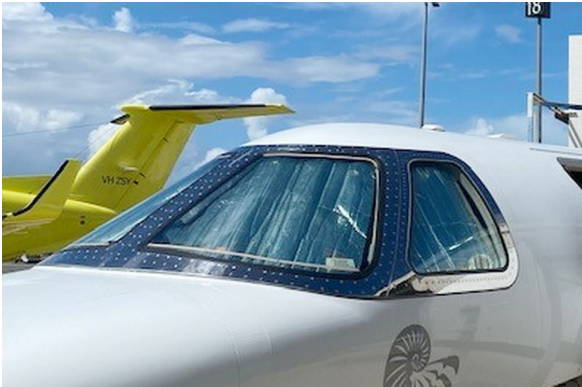
Cessna Citationjet CJ2 Cockpit HeatShields

Cockpit Heatshields are interior sunshades for the aircraft's cockpit. The product is a unique composite of closed-cell foam with a silver mylar finish. The semi-rigid design is stiff enough to stand inside the window framing. The set folds up flat and is easily stored in the included storage sleeve. Some designs may require velcro and suction cups. Our Heatshields for jets are offered white side out because some aircraft manufacturers have issued advisories against reflective window inserts due to potential heat damage. A Heatshield is an excellent short-term remedy for cockpit overheating, but an external fabric cover is more effective for long-term protection.