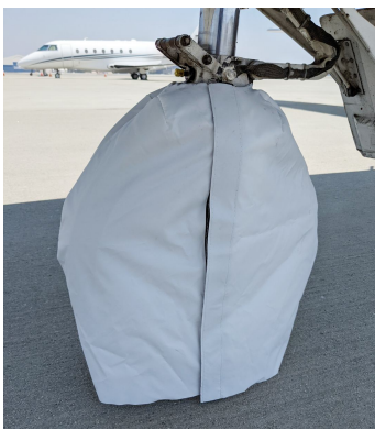
CJ1 Nose Gear Tire Cover, test fit

ALL-YEAR USE MATERIAL - Made with Silver Acrylic Sunbrella canvas, the all-year use material is the best option for sun protection and cover longevity. This heavier more durable material is intended for all weather conditions, such as rain and snow or lots of sun.