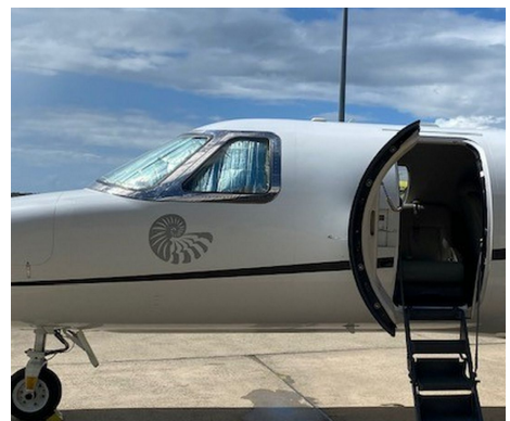
Cessna Citationjet CJ2 Cockpit HeatShields