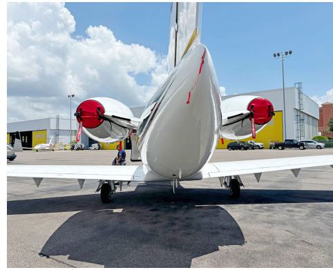
Cessna Citationjet 525C, CJ-4 Engine Inlet Covers & Exhaust Plugs