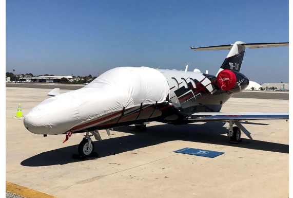
Citationjet CJ1 Cockpit/Nose Cover