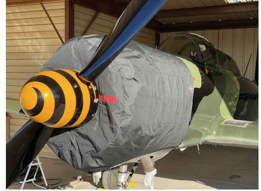
Nanchang CJ6 Insulated Engine Cover