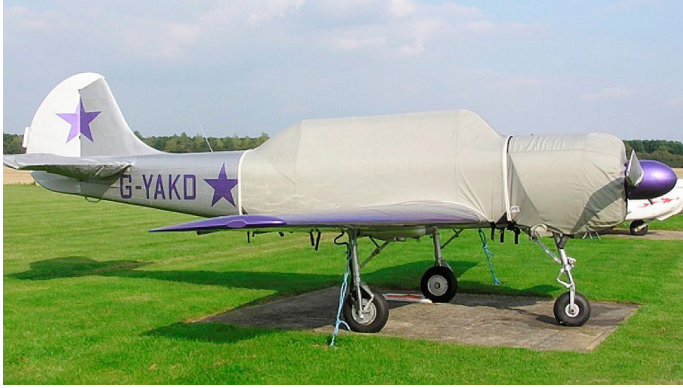
Yak 52 Extended Canopy, Engine & Horiz. Stab. Covers

The material is very reflective, and tests show that the cabin interior temperature can be reduced to near-ambient temperature on the hottest of days. It is water, ice and snow repellent, yet breathable to allow moisture to escape from between the cover and the aircraft surface.