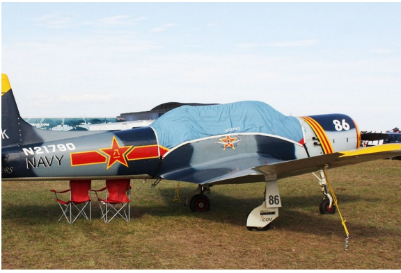
Malcomb Hood cover for a CJ-6