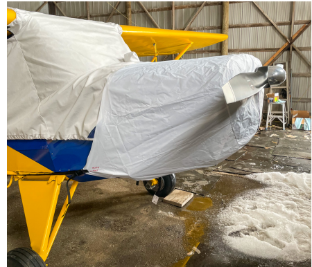
Fleet 80 Canuck Engine Cover, test fit cover