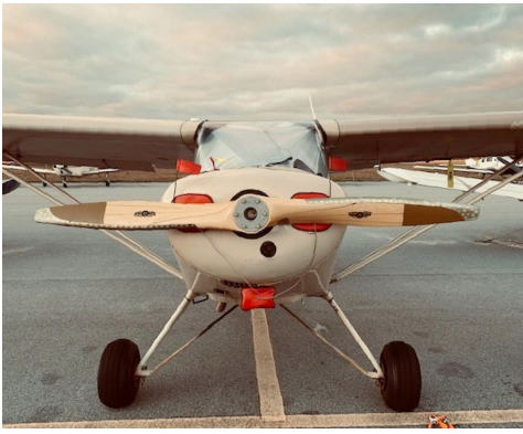
Taylorcraft Engine Inlet Plugs