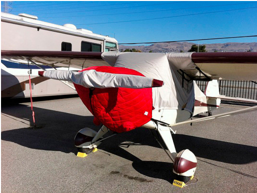
Taylorcraft Insulated Engine Cover, Prop and Canopy Covers

This cover type is made from Silver Acrylic Sunbrella canvas and is 100% lined with a soft and smooth microfiber. Bruce's Custom Covers developed this material combination especially for aircraft protection. The outer material is medium weight and treated for water resistance, UV resistance and anti-static buildup. The inner lining is a very soft and smooth microfiber to prevent scratching. The material is very reflective, and tests show that the cabin interior temperature can be reduced to near-ambient temperature on the hottest of days. It is water, ice and snow repellent, yet breathable to allow moisture to escape from between the cover and the aircraft surface.