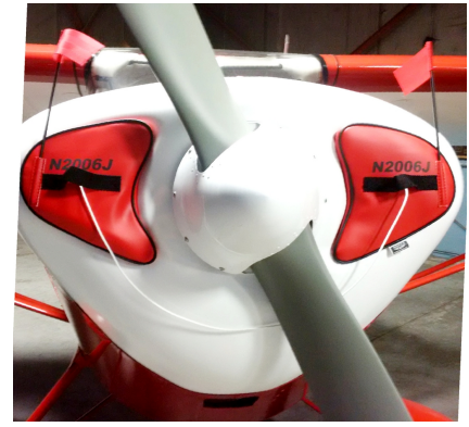
Taylorcraft Engine Inlet Plugs