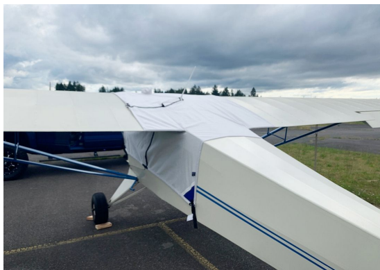
Taylorcraft Models F19 Over-The-Top Canopy Cover

This cover type is made from Silver Acrylic Sunbrella canvas and is 100% lined with a soft and smooth microfiber. Bruce's Custom Covers developed this material combination especially for aircraft protection. The outer material is medium weight and treated for water resistance, UV resistance and anti-static buildup. The inner lining is a very soft and smooth microfiber to prevent scratching. The material is very reflective, and tests show that the cabin interior temperature can be reduced to near-ambient temperature on the hottest of days. It is water, ice and snow repellent, yet breathable to allow moisture to escape from between the cover and the aircraft surface.