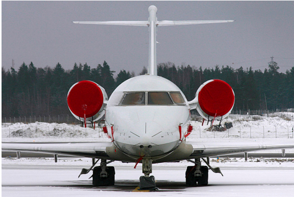
Challenger 604 Intake Covers, OEM design

The Canadair Regional Jet 200, 700 Bikini Style Engine Covers are a single-piece design using a soft and smooth stretchy and fabric. The cover stretches tightly over both the intake and exhaust, installing quickly and easily. These covers are designed to be used as hangar dust covers and have a useful life of approximately one year.