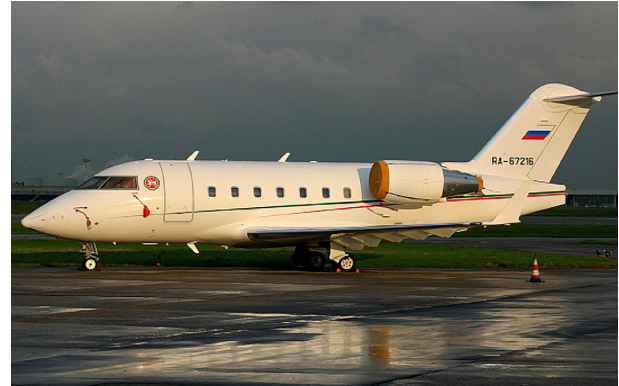
Challenger 604 Intake Covers, OEM design