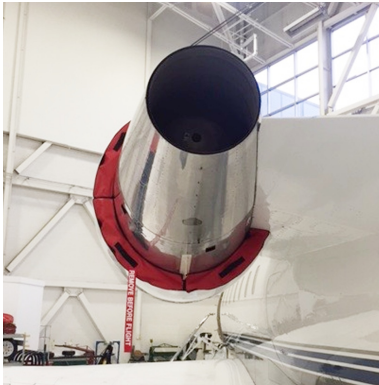
Canadair Challenger 604 Bypass Plugs

The Engine Inlet Plugs are custom fit for your Canadair Regional Jet 200, 700 intakes, made with heavy-duty vinyl material, and stuffed with a single block of sculpted urethane foam. Each plug has a zipper that allows the foam to be removed and dried if necessary. Engine plugs have 'remove before flight' streamers sewn onto the face of the plugs. Most plugs are imprinted with the aircraft registration number in black for an extra charge. Storage bag NOT included. Engine plugs may be inserted after flight when the engine is still warm. Engine Inlet Plugs are commonly referred to as Cowl Plugs, Intake Plugs, Cowl Blocks, Engine Blocks, and Engine Bungs.