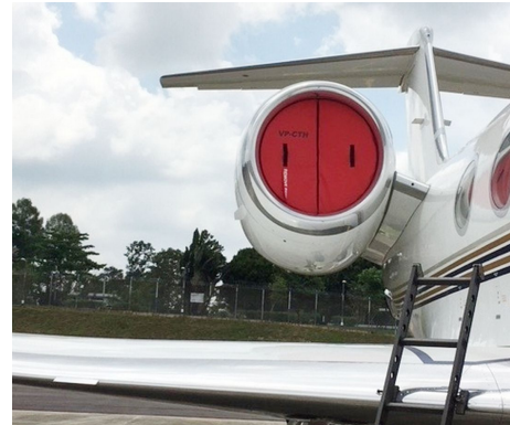
Grumman Gulfstream G450 Intake Plugs