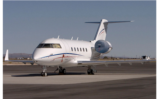
Challenger 604 Intake Covers, standard design