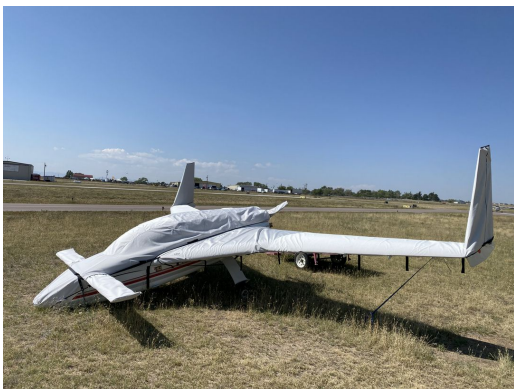
Cozy Mk IV Complete Cover Set

WINTER USE MATERIAL - Made with Solution-Dyed Polyester fabric, this option is intended for seasonal use to aid in deicing, rain mitigation, or for occasional travel. The material is lighter and more compact, but more susceptible to UV damage and may have a shorter useful life if used continuously outside than the all-year use material.