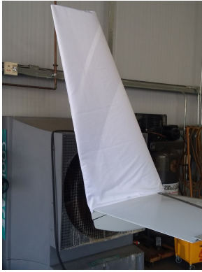
Velocity Vertical Stabilizer Covers, test fit cover