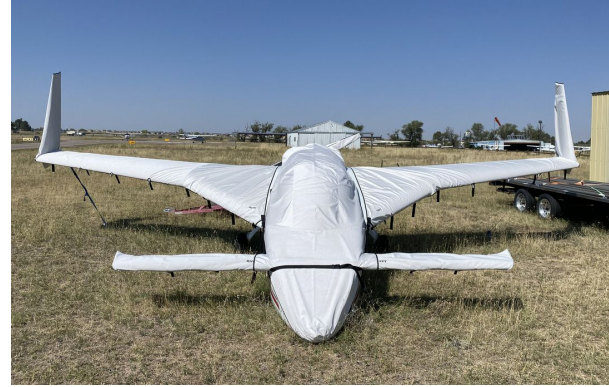
Cozy Mk IV Complete Cover Set