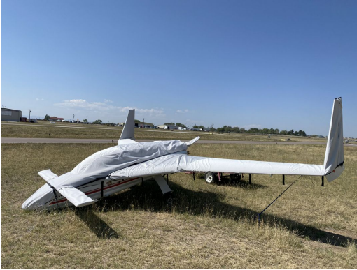
Cozy Mk IV Complete Cover Set

water resistance, UV resistance and anti-static buildup. The inner lining is a very soft and smooth microfiber to prevent scratching. The material is very reflective, and tests show that the cabin interior temperature can be reduced to near-ambient temperature on the hottest of days. It is water, ice and snow repellent, yet breathable to allow moisture to escape from between the cover and the aircraft surface.