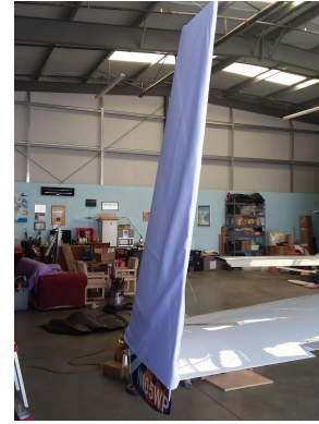
Velocity Vertical Stabilizer Covers, test fit cover