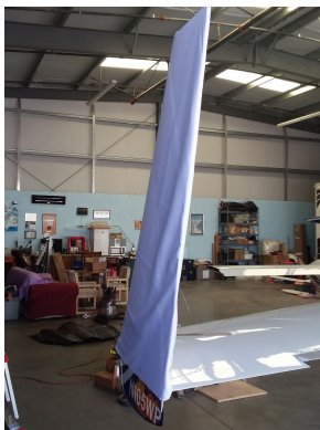
Velocity Vertical Stabilizer Covers, test fit cover

WINTER USE MATERIAL - Made with Solution-Dyed Polyester fabric, this option is intended for seasonal use to aid in deicing, rain mitigation, or for occasional travel. The material is lighter and more compact, but more susceptible to UV damage and may have a shorter useful life if used continuously outside than the all-year use material.