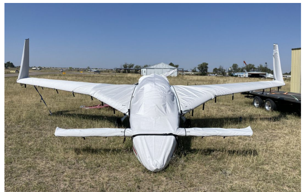
Cozy Mk IV Complete Cover Set