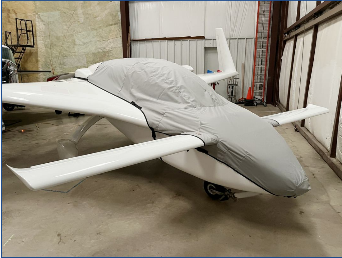
Cozy Mk IV Canopy/Nose Cover, travel weight