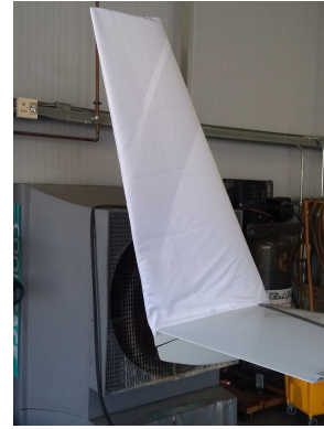
Velocity Vertical Stabilizer Covers, test fit cover