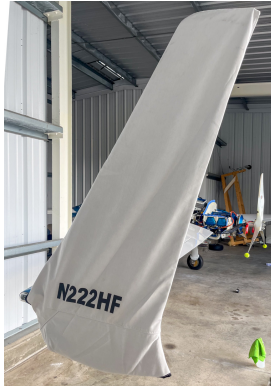
Cozy All Models Vertical Stabilizer Covers, All Year Use