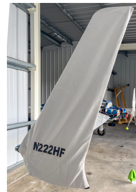
Cozy All Models Vertical Stabilizer Covers, All Year Use