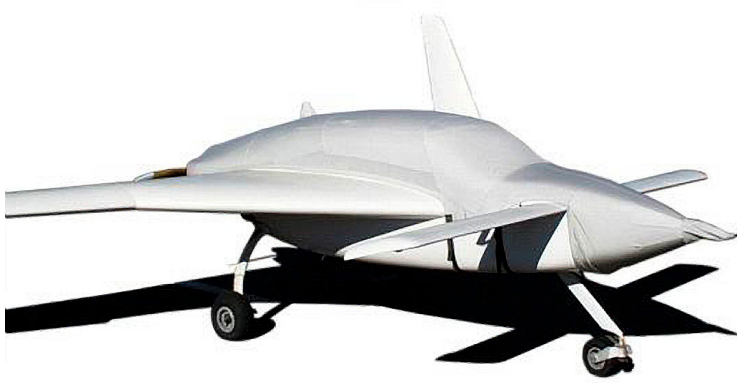
Velocity Canopy/Nose/Engine Cover

water resistance, UV resistance and anti-static buildup. The inner lining is a very soft and smooth microfiber to prevent scratching. The material is very reflective, and tests show that the cabin interior temperature can be reduced to near-ambient temperature on the hottest of days. It is water, ice and snow repellent, yet breathable to allow moisture to escape from between the cover and the aircraft surface.