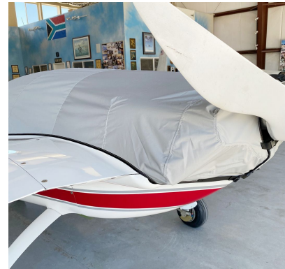
Cozy Mk IV Canopy/Nose/Engine Cover, travel weight design