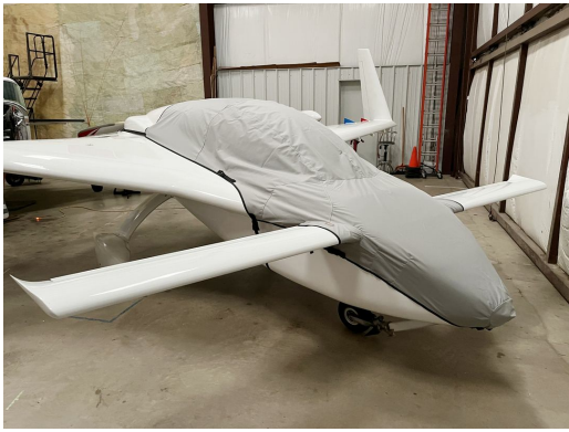
Cozy Mk IV Canopy/Nose Cover, travel weight