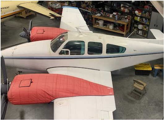
Standard Canopy Cover & Engine Plugs. Extended Canopy Cover & Engine Cover Beech Baron B55 Insulated Engine Covers