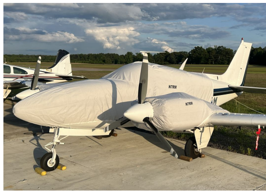
Beech C55 Baron Extended Canopy/Nose Cover, Engine Covers