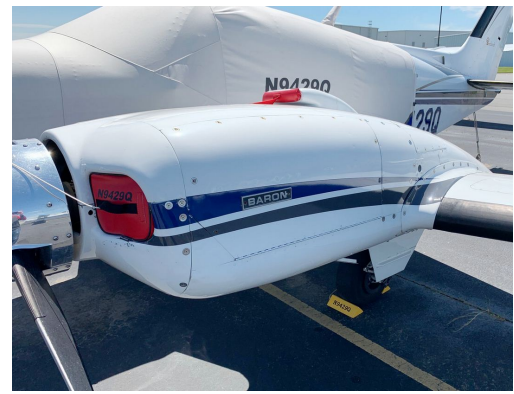
Beech Baron 58 Engine Plugs