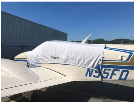
Beech Baron 95-B55 Canopy cover