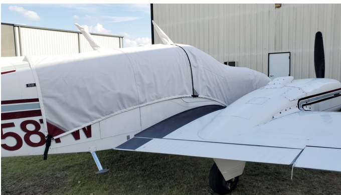
Beech Baron 58 Canopy/Nose Cover

This cover type is made from Silver Acrylic Sunbrella canvas and is 100% lined with a soft and smooth microfiber. Bruce's Custom Covers developed this material combination especially for aircraft protection. The outer material is medium weight and treated for water resistance, UV resistance and anti-static buildup. The inner lining is a very soft and smooth microfiber to prevent scratching. The material is very reflective, and tests show that the cabin interior temperature can be reduced to near-ambient temperature on the hottest of days. It is water, ice and snow repellent, yet breathable to allow moisture to escape from between the cover and the aircraft surface.