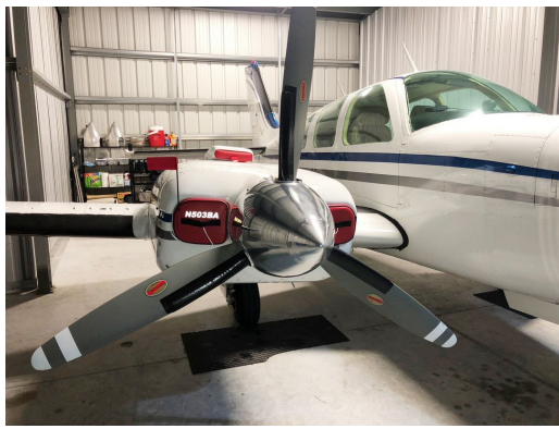
Beech Baron Engine Plugs