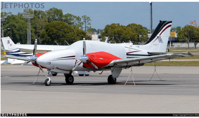
Beech Baron 58, G58 Canopy Cover, Insulated Engine Covers