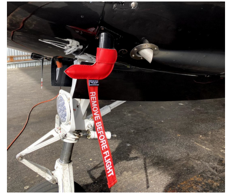
Beech Baron 58 Engine Inlet Plugs, Cowl Top Plugs, Heater Inlet, Pitot Cover