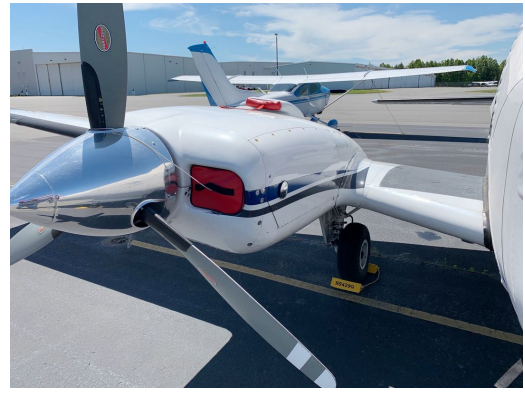
Beech Baron 58 Engine Plugs