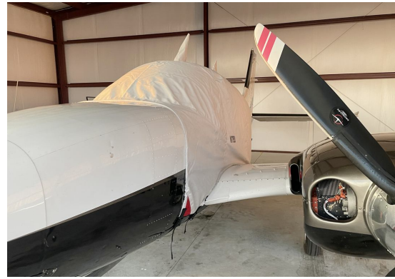
Beech Baron 58TC Extended Canopy Cover