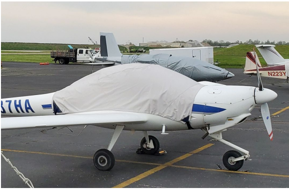
Diamond DA-20 Katana

This cover type is made from Silver Acrylic Sunbrella canvas and is 100% lined with a soft and smooth microfiber. Bruce's Custom Covers developed this material combination especially for aircraft protection. The outer material is medium weight and treated for water resistance, UV resistance and anti-static buildup. The inner lining is a very soft and smooth microfiber to prevent scratching. The material is very reflective, and tests show that the cabin interior temperature can be reduced to near-ambient temperature on the hottest of days. It is water, ice and snow repellent, yet breathable to allow moisture to escape from between the cover and the aircraft surface.