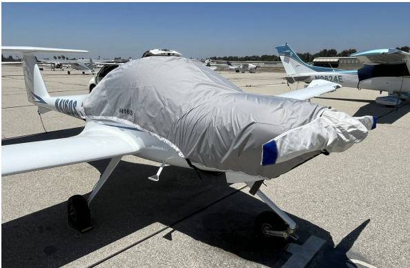
Diamond DA-20 Canopy/Engine Cover (Travel Weight), Prop Cover

This cover type is made from Silver Acrylic Sunbrella canvas and is 100% lined with a soft and smooth microfiber. Bruce's Custom Covers developed this material combination especially for aircraft protection. The outer material is medium weight and treated for water resistance, UV resistance and anti-static buildup. The inner lining is a very soft and smooth microfiber to prevent scratching. The material is very reflective, and tests show that the cabin interior temperature can be reduced to near-ambient temperature on the hottest of days. It is water, ice and snow repellent, yet breathable to allow moisture to escape from between the cover and the aircraft surface.