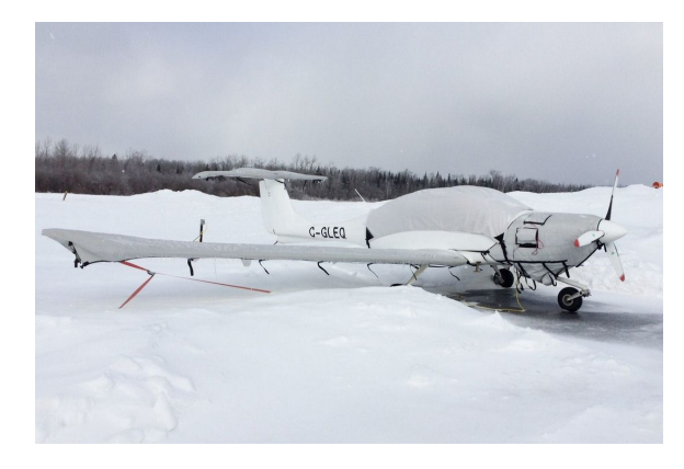
Diamond DA40 Canopy, Insulated Engine, Wing and Stab. Covers