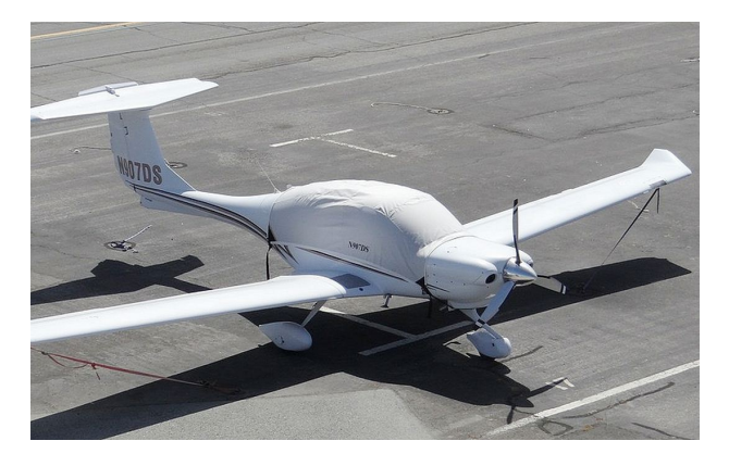
Diamond DA-40 Canopy Cover

This cover type is made from Silver Acrylic Sunbrella canvas and is 100% lined with a soft and smooth microfiber. Bruce's Custom Covers developed this material combination especially for aircraft protection. The outer material is medium weight and treated for water resistance, UV resistance and anti-static buildup. The inner lining is a very soft and smooth microfiber to prevent scratching. The material is very reflective, and tests show that the cabin interior temperature can be reduced to near-ambient temperature on the hottest of days. It is water, ice and snow repellent, yet breathable to allow moisture to escape from between the cover and the aircraft surface.