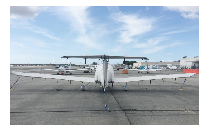
Diamond DA-40 Full Cover Set