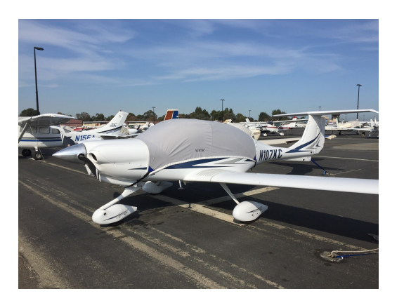
Diamond DA-40 Travel Cover, Light Weight Travel Canopy Cover