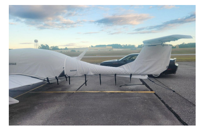
Diamond DA-40 Winter Cover Set

WINTER USE MATERIAL - Made with Solution-Dyed Polyester fabric, this option is intended for seasonal use to aid in deicing, rain mitigation, or for occasional travel. The material is lighter and more compact, but more susceptible to UV damage and may have a shorter useful life if used continuously outside than the all-year use material.