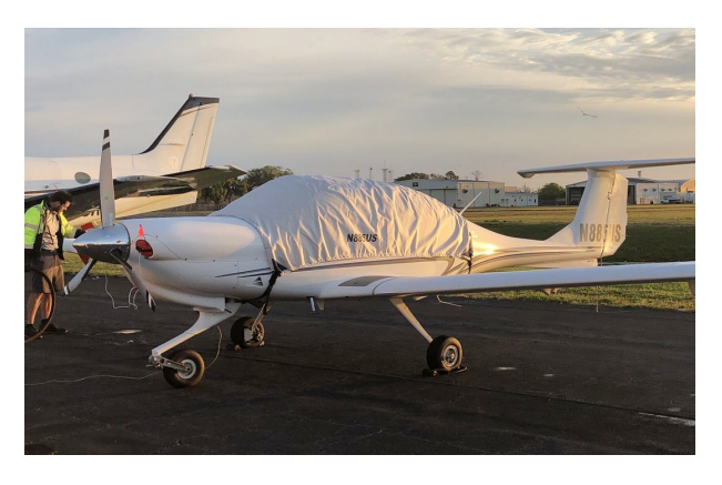
Diamond DA-40 Canopy Cover & Engine Plugs